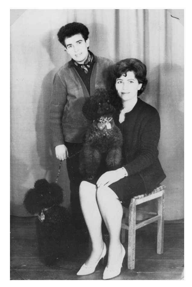
Fig. 4. Schwules Museum, Berlin, Bestand Deutsche Demokratische Republik, Nr. 32, 3b.

and 1930s Ireland, at the center of a group of female friends who happily performed for the camera in a whole range of "unladylike" ways—in swimsuits, for example, and with cigarettes in their fingers. Stokes and her friends replaced the usual photographic conventions of children, weddings, and family holidays with all-female outings, silliness, and fun.<sup>12</sup>