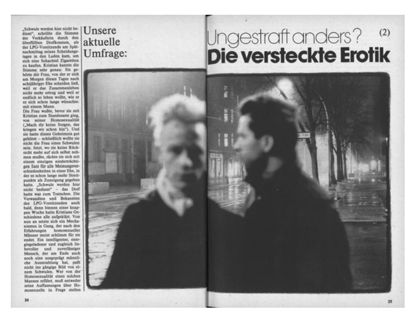
Fig. 10. Das Magazin 2/1989, 24-25.

figure sits alone in a run-down apartment, illuminated by what appears to be a television screen. This young man, who wears a headband and a bracelet, is dressed in a recognizably "alternative" style. He appears isolated, lost in thought and despair—an impression reinforced by the headline "Der verstossene Mensch (The Outcast)." The lead illustration of the second article, a photograph taken by Kurt Buchwald, foregrounds two blurry figures on a deserted, wet, dark, and wintry street (Figure 10).<sup>37</sup> Their features and clothing are out of focus, but at least one appears alternative—with bleached (or naturally very light) hair and a light scarf. In combination with the headline "Die versteckte Erotik (The Hidden Erotic)," the photo evokes a nighttime liaison. The illustration of the final article—another photo by Andreas Fux—also alludes to urban East German subcultures, showing a young man posing topless in front of a derelict, bricked-up building (Figure 11). As in Gröszer's painting, Fux draws a parallel between queerness and the subcultural spaces being created on the margins of GDR life. All three photographs create a feeling of tension and anticipation, a message that accorded well with the series' depiction of a gay community awaiting a sea change in public opinion.