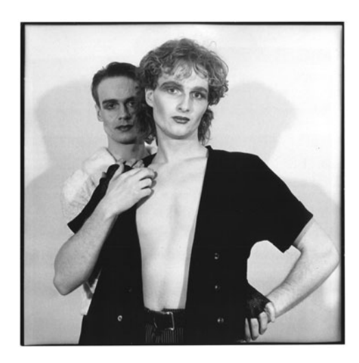
Fig. 7. "Rocco and Raik," from Eva Mahn, Nichts ist mehr wie es war (Bilder 1982–1989) (Heidelberg: Braus, 1992).

As part of a series of work on androgyny and the body, Halle photographer Eva Mahn staged photographs of seemingly gay models wearing heavy makeup. <sup>30</sup> In Figure 7, the couple meets the viewer's gaze in a way that is challenging but also somewhat poignant. Their pale makeup, heavy eyebrows, and black-and-white clothes recall a Pierrot, while the smooth chest front and center of the image underscores the impression of androgyny. The photograph creates a sense of wounded defiance and dignity, of a resolution to stand together against the slings and arrows of the world. In fact, the figures in the photograph were not a couple or even gay. <sup>31</sup> Mahn—herself heterosexual—explained: "I found them so beautiful that I thought, if we put makeup on them, it's quite believable." <sup>32</sup> This photograph alludes to the documentary tradition and to the sort of private photographs discussed earlier, but its staging owes much more to Mahn's artistic imagination than to any gay reality. For Mahn's purposes, the "authenticity" of the couple was not an issue—in fact, because much of her work explored the constructed nature of gender and sexuality, the practice of "sexual drag" may even have enhanced the appeal of these subjects. What mattered to Mahn was the beauty of her subjects, the artificiality of makeup, and the challenge to the preconceptions and prejudices of the viewer.