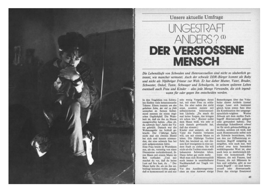
Fig. 9. Das Magazin, 1/1989, 42-43.

It is not difficult to see why queerness appealed to alternative artists: it involved both a marginalized social group (with a pleasingly subcultural aesthetic), as well as performative subjects who were visibly in the process of constructing the self. Yet, as we have seen, both Mahn and Gröszer's queer figures were, in large part, imaginary constructions of the artistic process—with little attempt to draw on any "queer reality." It is also striking that both images use the conventions of the couple's portrait (Gröszer's paid homage, no doubt, to the café portraits of Otto Dix), rather than posing the figures alone or in a larger group.