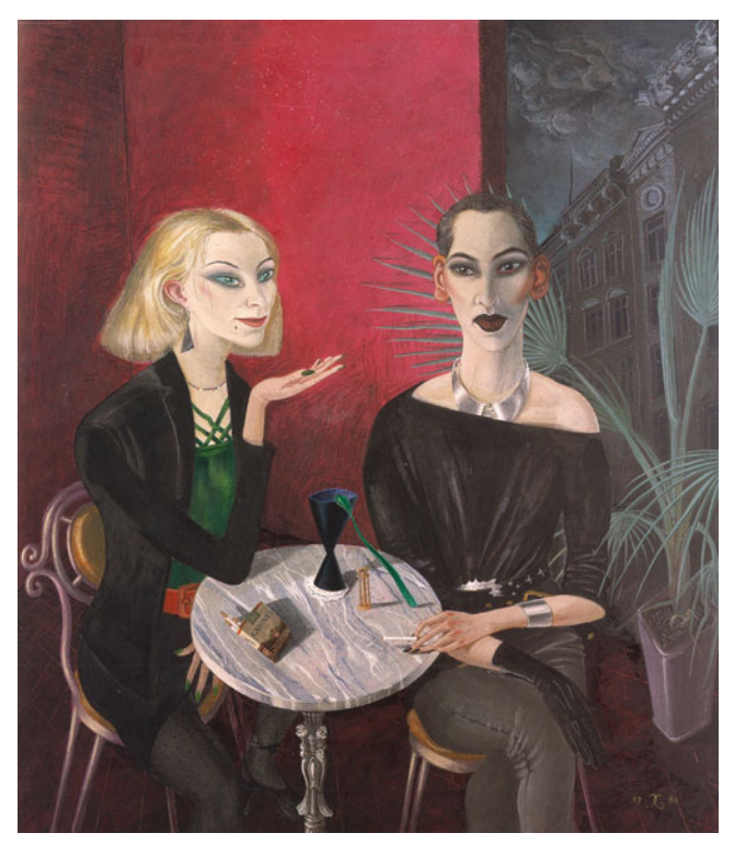
Fig. 8. (Color online) Clemens Gröszer, Café Liolet, 1986. Kunstmuseum Dieselkraftwerk Cottbuss © VG Bild-Kunst Bonn.

could have become "legendary"—even if only within alternative circles—suggests that gay culture was resonating outside of its former confines.