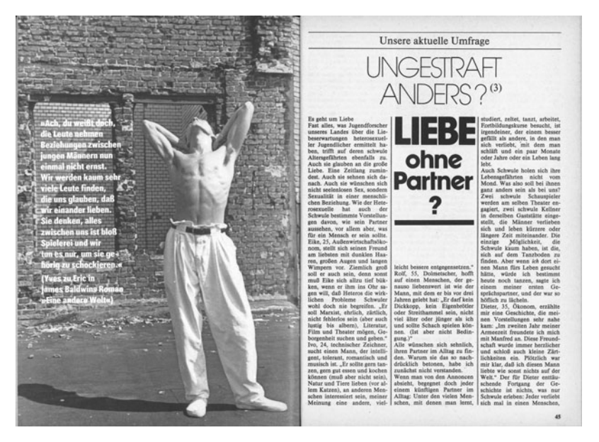
Fig. 11. Das Magazin 5/1989, 44-45.

sexuality in the same way as the classical nude it adapted. Das Magazin , by contrast, deliberately drew its readers' attention to the sexual desires and frustrations of gay men.