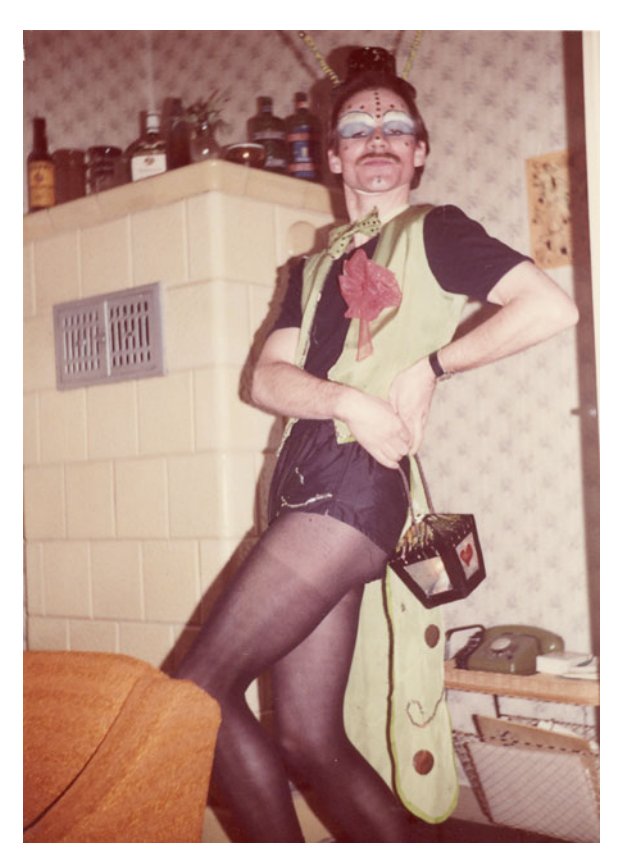
Fig. 3. (Color online) Schwules Museum, Berlin, Bestand Heino Hilger, Nr. 5, 6b.

application of makeup and the donning of a Sally Bowles-style outfit, but also by a stiff drink and the trying out of some poses in front of the camera. It is not difficult to imagine the encouraging shouts and catcalls from the rest of the party. Taking a photograph provided an opportunity to rehearse poses and pouts, to try on a different identity, and to transform one's workaday self into "Glühwürumchen" before stepping in front of the public stage. The transgressive quality of the photograph gave one permission to act outrageously, and once the evening was over, a photograph was evidence of one's queer self—proof that it had existed and would do so again. 9