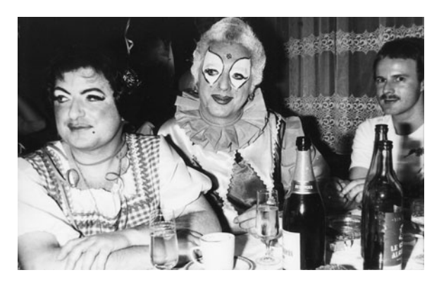
Fig. 12.

dressing, heavy makeup, exposed buttocks. Yet, the camera lingers on the visible affection and connection between the couples on the dancefloor. In an echoing of Figure 3, the viewer sees not just gay desire but intimacy as well.