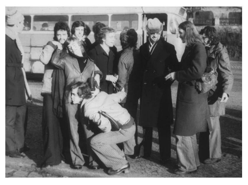
Fig. 6. Homosexuelle Interessengemeinschaft Berlin outing.

monogamous norms of GDR society, but also the aspirations to public invisibility of an older generation of gay men.