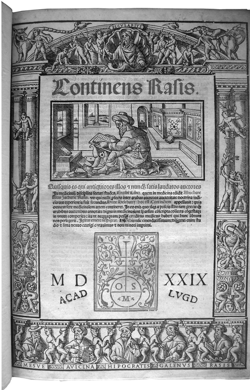
Figure 4: Rhazes, Continens Rasis: quisquis es qui antiquiores... , 2 vols (Venice: Ottovano Scoto, 1529), Vol. I, title page. Courtesy: Leiden University Library, obj. nr. 631 A 11-1.