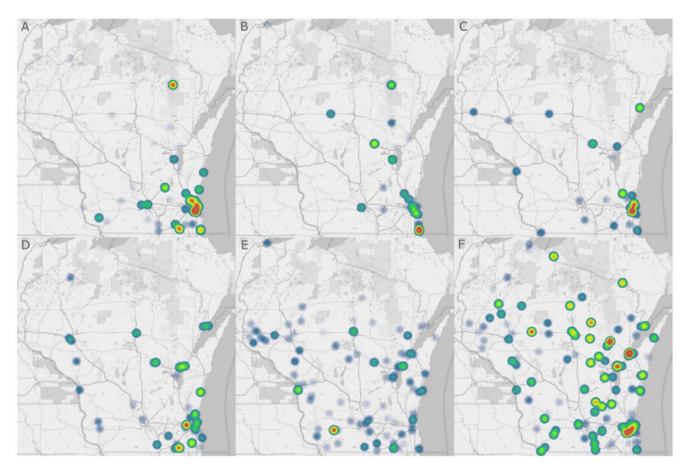
Figure 2: Map of COVID-19 incidence in Wisconsin nursing homes from January to October.