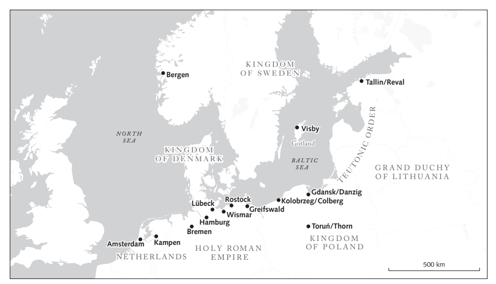
Figure 3. The North Atlantic and The Baltic