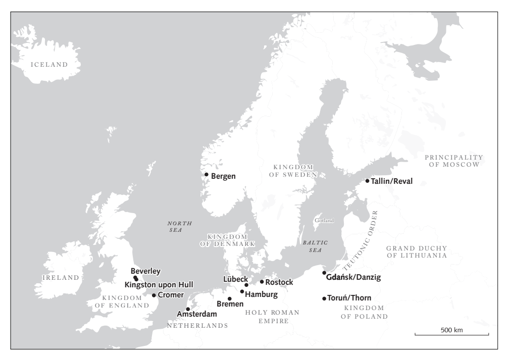
Figure 2. The fifteenth-century Baltic

Source: After Lukas Jentsch and Harm Schwerdtfeger.