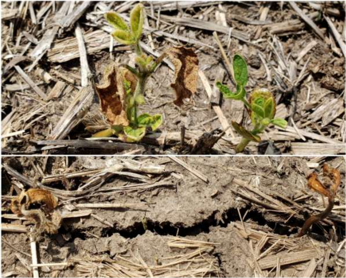
Figure 3. Injury symptoms on dicamba/glufosinate/glyphosate-resistant volunteer soybean 34 d after PRE application of isoxaflutole/thiencarbazone-methyl + atrazine ( 129 + 560 \text{ g ai ha}^{-1} ) in a field experiment conducted near Clay Center, NE in 2021.