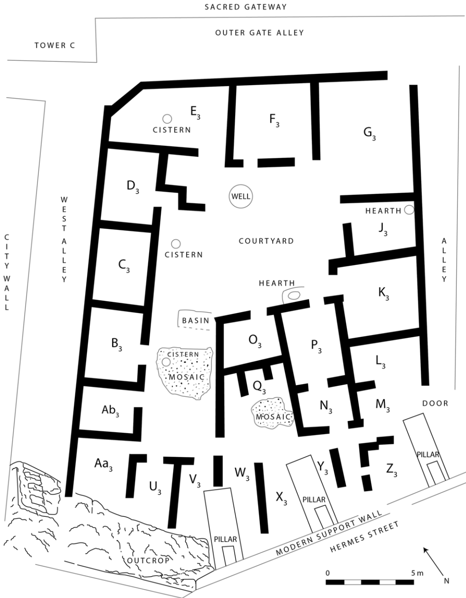
Fig. 1. Plan of Bau Z3, Kerameikos. Drawing by Thanasi Papapostolou based on Knigge (2005) supplement 5 and Ault (2016) fig. 4.4.

under her spell. The depiction of the activities that took place in the building, for example, Euktemon dining with Alke (6.21), its location near the postern gate (6.20) and the mention of oikēmata where Alke allegedly worked, albeit not here but in a building Euktemon had previously owned in the Piraeus (6.19), were linked to the archaeological finds of Bau Z and used as a template for interpreting them. The small personal items of jewellery and religious figurines were seen therefore as the property of foreign slaves (the paidiskai of Euktemon's Piraeus sunoikia , 6.19), the coins were evidence for the selling of sex and the