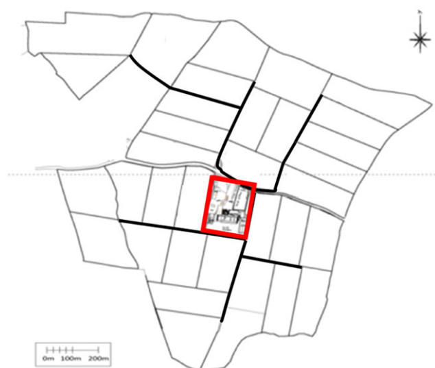
Figure 1. A layout of a pasture based dairy farm. An integrated farm roadway network and the farmyard location within the grazing platform. Red box: farmyard location. Figure sourced from Maher et al. (2023a).

access areas of pasture from farm roadways while reducing treading damage to the paddock. This involves the creation of narrow roadways (1–2 m wide) to allow the herd to access the furthest points of grazing paddocks without causing damage to areas already grazed. It has also been recommended that the furthest point from a roadway to the back of a paddock is no more than 250 m on dry land and 50–100 m on heavier soil types (Teagasc, 2021). Adding additional entry/exit points to paddocks reduces treading damage of a single entry/exit point which deteriorates the quality of the surface. This has been associated with increased lameness on pasture-based farms (Browne et al. , 2022a).