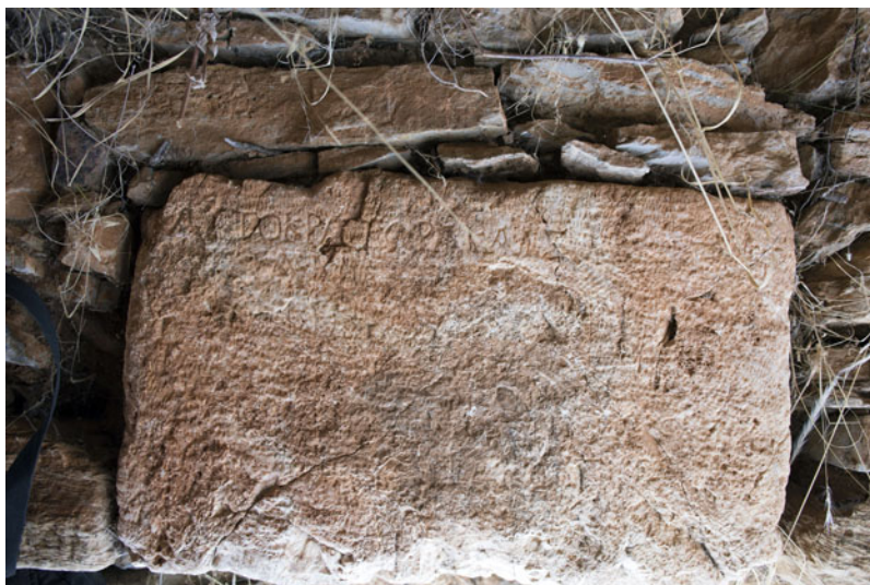
Fig. 8. Antiochia ad Cragum Inscription 18.06, embedded in east wall of Peristyle Building.

Statue base of Sabina (AI 18.04; Fig. 7), 128–37 CE