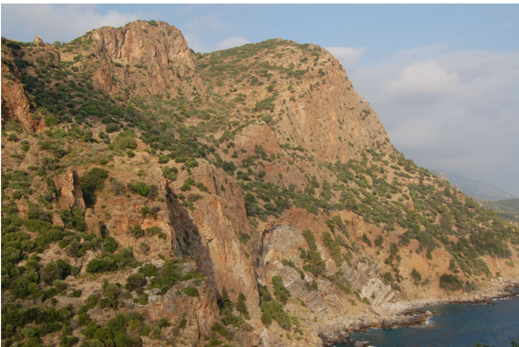
Fig. 4. General view of Kragos, from the west.