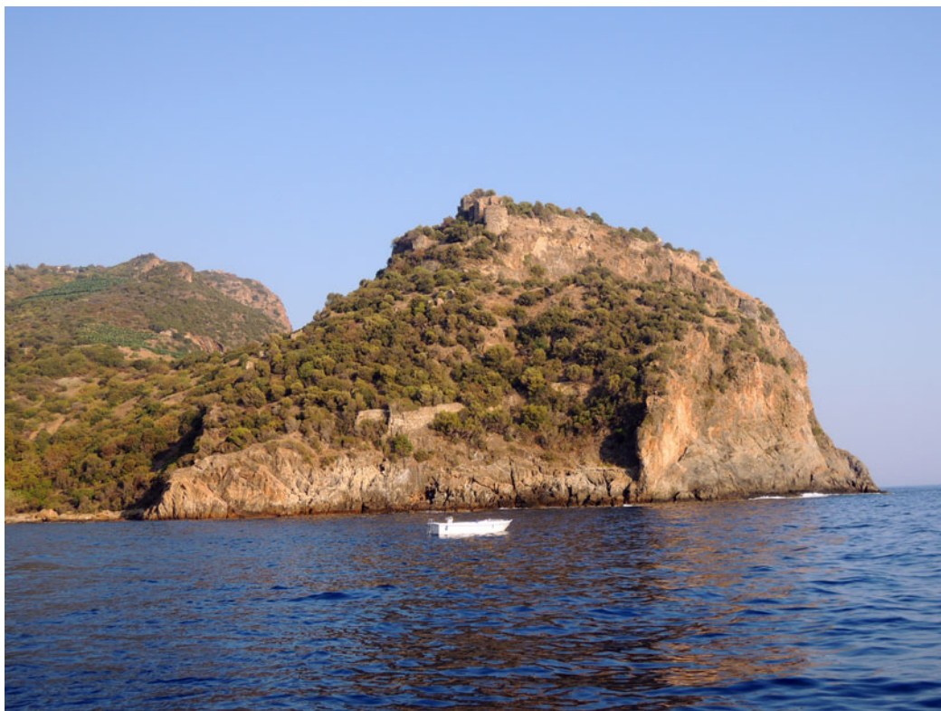
Fig. 5. General view of Antikragos, from the northwest.

sites probably served as their more permanent domiciles. In 2004–5, underwater survey was undertaken in the small bight adjacent to the Antikragos that is assumed to have served as the anchorage of the Roman city. This investigation did produce several finds that may be associated with the period of pirate activity: they include a fragment of a Will Type 10 amphora that is generally dated to the 1st c. BCE and a bronze socket decorated in the form of the winged horse Pegasus, a type attached to the ends of ship timbers. Wood material recovered from the socket indicates an approximate calibrated radiocarbon date of 125 BCE, which would place the socket during the pirates' heyday. 12 While not conclusive, these stray finds offer tantalizing evidence that the anchorage, and thus likely the site as well, were occupied at the time that Appian places the pirates here.