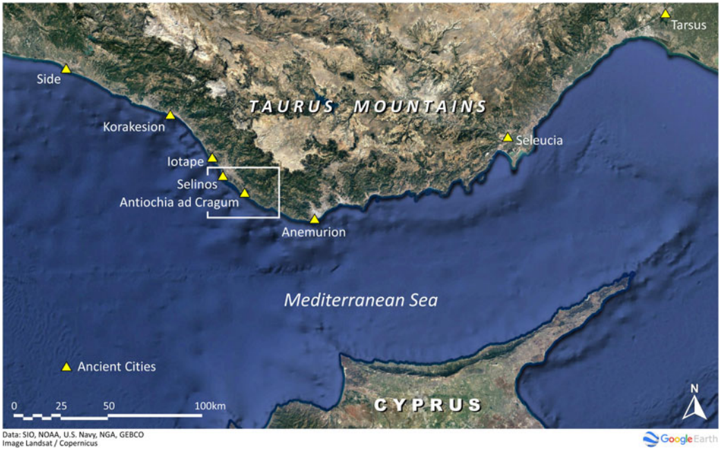
Fig. 1. Major coastal sites of southern Turkey from Pamphylia to Cilicia. (Map by B. Cannon.)