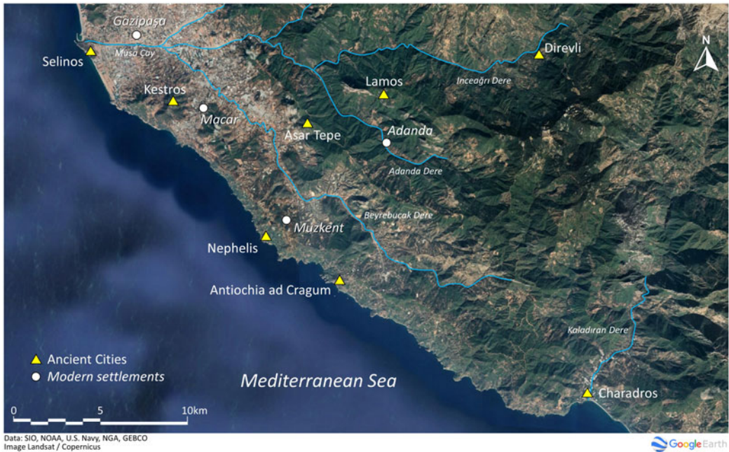
Fig. 2. Western Rough Cilicia. Ancient cities and major river basins.