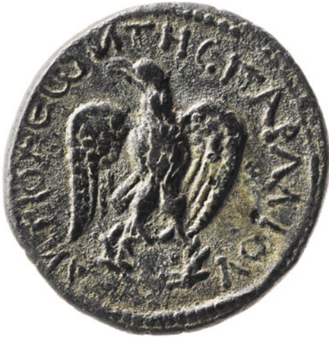
Fig. 6. Antiochia ad Cragum. Valerian (117–38 CE), bronze alloy. Rev. Eagle, frontal, head turned towards left; ANTIOΧΕΩΝ ΤΗΣ ΠΑΡΑΛΙΟΥ. BM 1979,0101.2561.