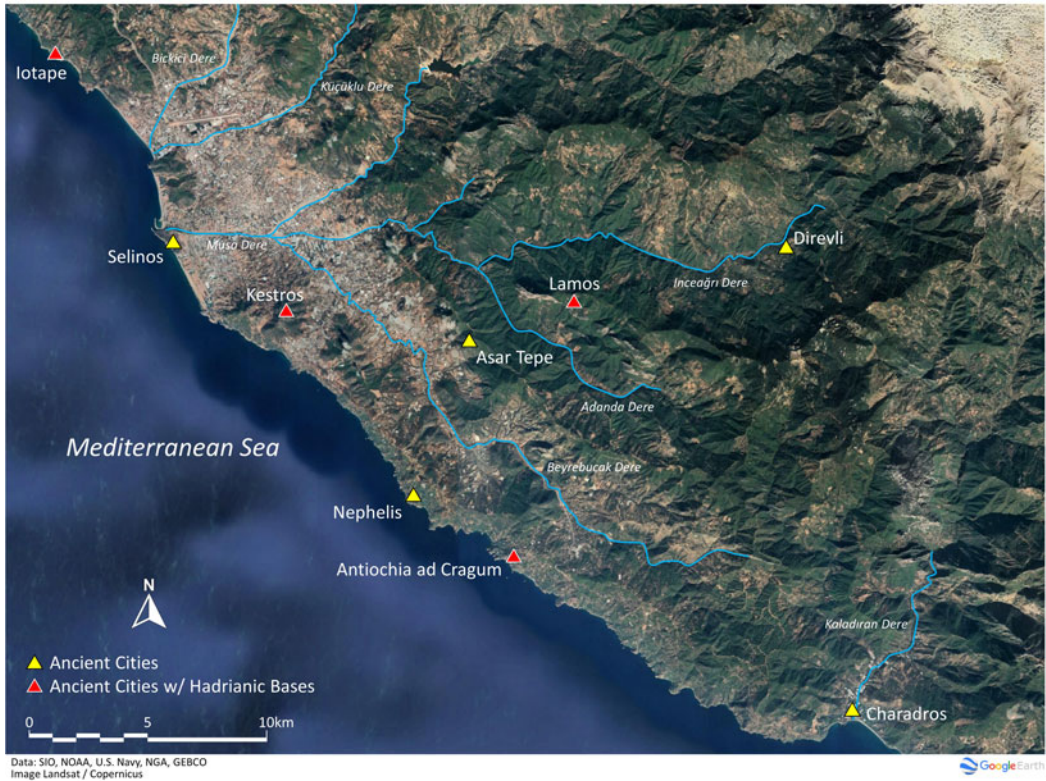
Fig. 9. Major sites of western Rough Cilicia with distribution of Hadrianic bases. (Map by B. Cannon.)

bases along the side walls belonged to Titus, Nerva, and Trajan. 45 The final two bases closest to the doorway were dedicated to Hadrian; that on the east side also contains a dedication to Sabina. The two Hadrian statues thus stood facing each other.