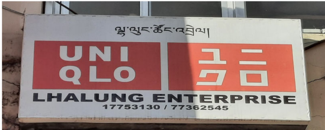
Figure 7. Trilingual Shop Sign of Dzongkha-English-Japanese.

multilingual shop names. However, as per the data collected, there is an uneven font size in the Dzongkha script making it difficult to comprehend shop owners' preferences in the language use. On the other hand, the smaller font size presented in English and other languages indicates supplementary information.