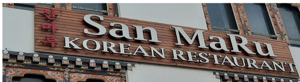
Figure 6. Bilingual English–Korean shop sign.