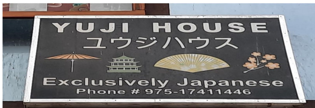
Figure 5. Bilingual English–Japanese shop sign.