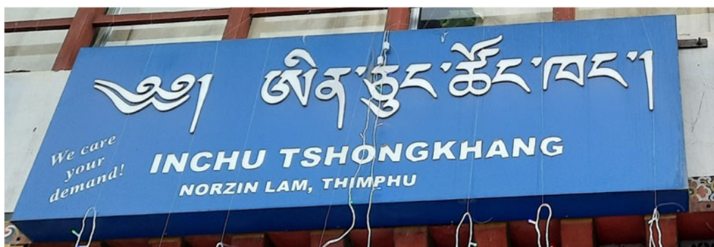
Figure 8. Larger Dzongkha font size over English.

This study set out with the aim to examine the LL of Nordzin Lam in Thimphu particularly paying a closer attention to languages used on the shop name signs. The most important finding is that English is de rigueur on all the shop names irrespective of monolingual, bilingual, or multilingual shop signs. This result is contrary to the signage guidelines (TT 2017) and the national policy and strategy of Dzongkha development (RGoB 2012), which state that shop signs should be written in Dzongkha and English. In addition, Dzongkha has a high presence in the bilingual signs, but English is the preferred language of the shop names. In terms of code preference, shop owners prefer Dzongkha on top of the other languages and are placed in a vertical position. These findings are in accord with the signage guideline, in which Dzongkha is the mandatory language on the signboards where Dzongkha script should be bigger or equal to English script and should be placed above English.