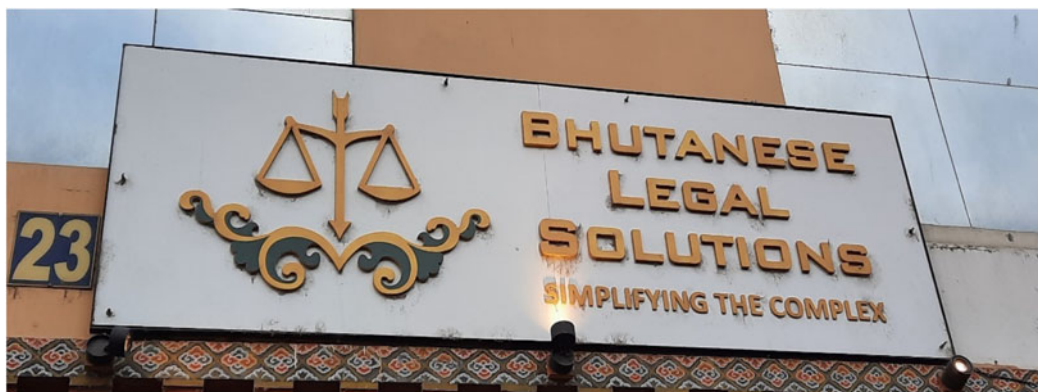
Figure 3. Monolingual English shop sign.