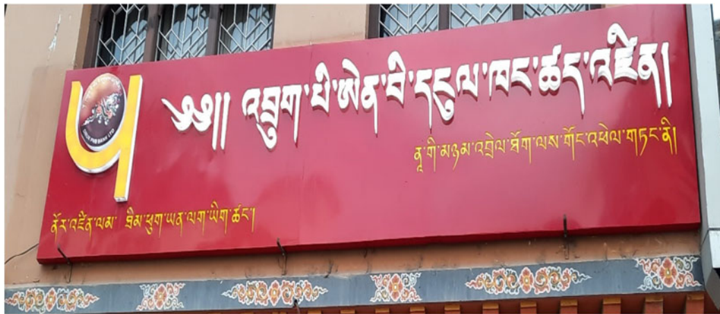
Figure 2. Monolingual Dzongkha shop sign.