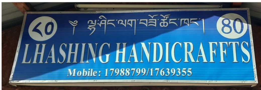
Figure 4. Bilingual English–Dzongkha shop sign.

On the other hand, a single shop name sign was written in an English–Korean combination (see Figure 6) and an English–Japanese combination (see Figure 5) was also found in the Nordzin Lam. These findings indicate that bilingual English–Dzongkha is the preferred language choice. This may be due to the government policy on the mandatory use of English–Dzongkha combination shop name signs.