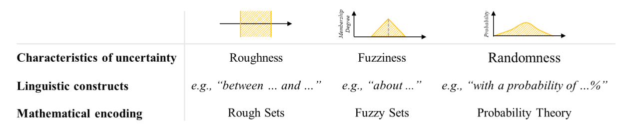
Figure 1. Characteristics of uncertainty