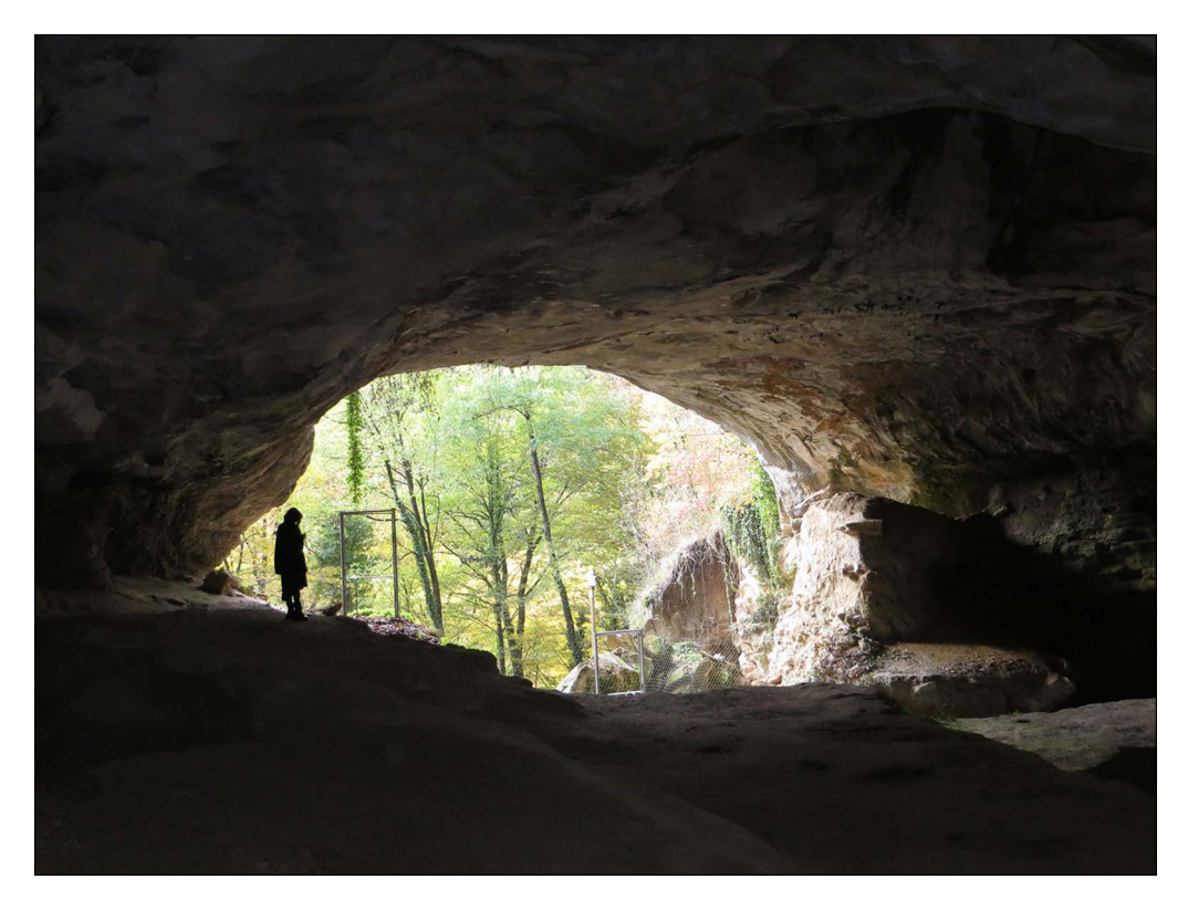
Figure 2. Vindija cave.

Upper Palaeolithic interface in Vindija, specifically regarding the large discrepancies in direct dates of Neanderthal remains (see Devièse et al. 2017 and references therein).