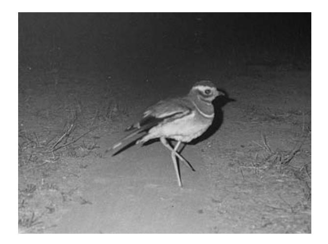
Plate 1 Automatic flash photograph of a Jerdon's courser triggered when the bird broke an infra-red beam at 00.24 on 14 February 2001. The bird is leaving footprints across a tracking strip (a 25 cm wide, 5 m long strip of fine soil placed between the transmitting and receiving units of the triggering device).

Excluding a few nights on which the triggering devices malfunctioned, the cameras operated for 42 cameranights (22 in JC1 and 20 in JC2). Four photographs of birds were obtained, two of Jerdon's courser (at two sites in JC1; Plate 1), one of stone-curlew Burhinus oedicnemus and one of red-wattled lapwing Vanellus