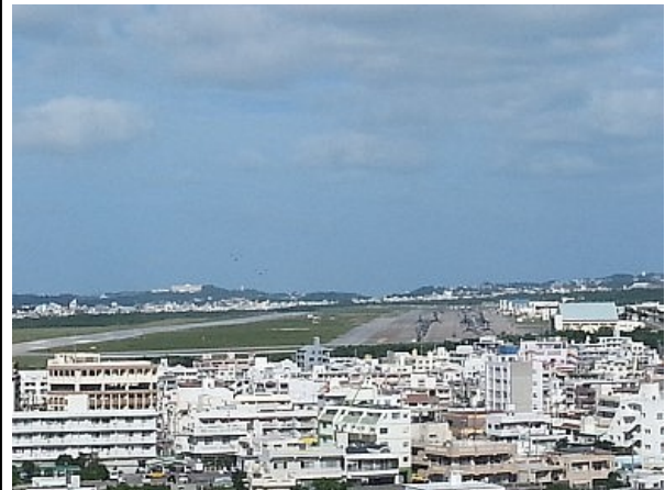
Futenma air station, surrounded by homes and businesses.

The directive states that AICUZ programs are required for bases within the US and its territories and possessions, and that they “may be developed” at bases in foreign countries. That means they are not required. But at MCAS Futenma an AICUZ program exists, though for “noise study only”. (appendix [b]) As for clear zones, the aerial photograph above shows that MCAS Futenma has adopted the perfect bureaucratic solution: the requirement to have clear zones has been met by simply designating two areas (largely off the base) as “clear zones” while doing nothing actually to clear them. This, presumably, is what shocked the not easily shockable Donald Rumsfeld. Every USMC Air Facility inside the US has clear zones entirely within the base. Futenma base isn’t large enough to do that.