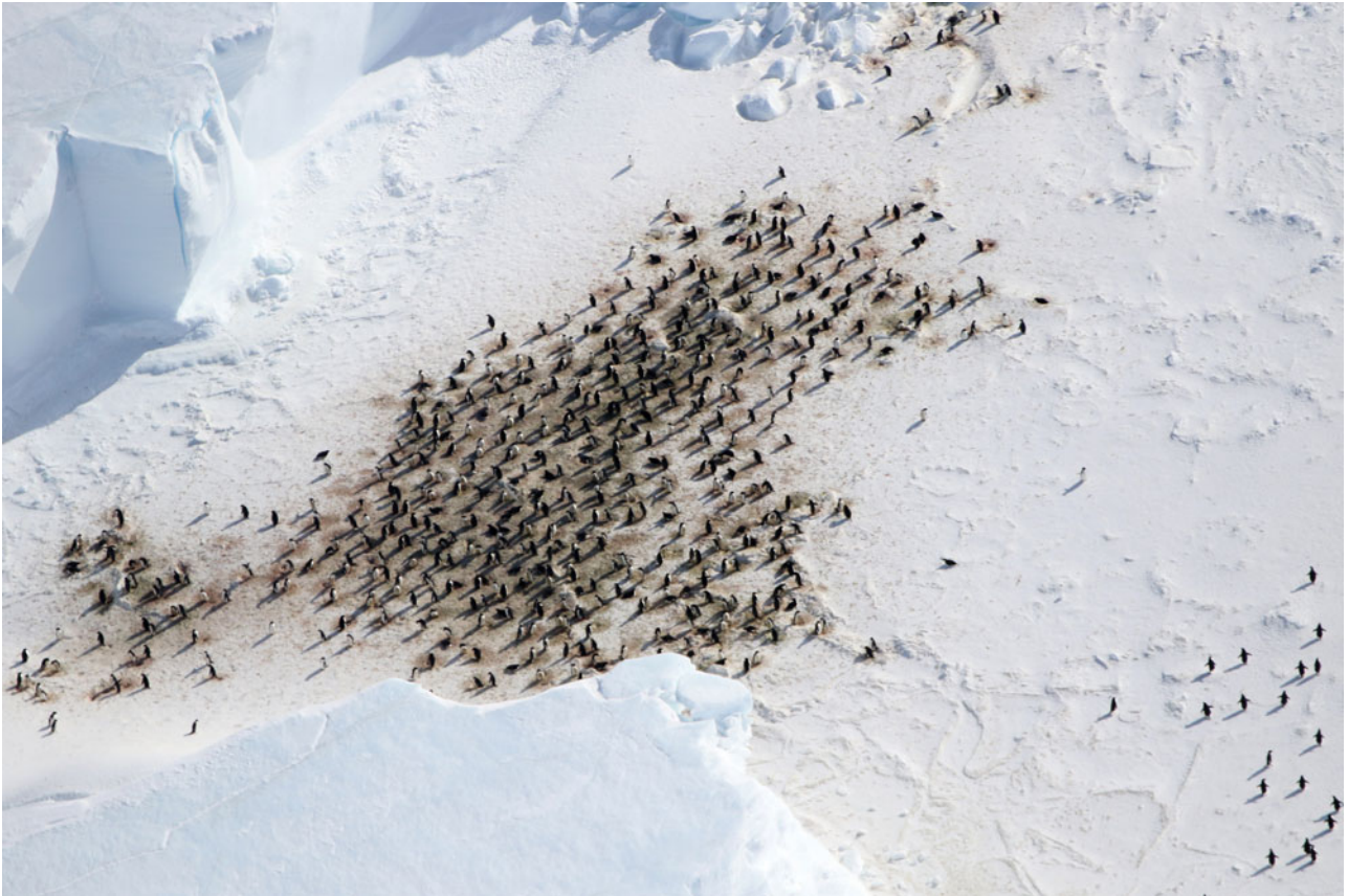
Fig. 3. Adélie penguins on the fast ice off the coast of the Cape Crozier colony on the last day of observations, 15 November 2018.

f9bf0107-d6df-4f30-9479-36c76b23969e-inv). However, there was a storm on 3 December, and it seems that the colony was lost. The fate of the individual birds is not known; the fast ice was effectively gone by 4 December and remained that way through 12 December as confirmed by VHR (catalogue ID: 1040010045C93C00) and 19 December, as confirmed by helicopter. Thus, this satellite sub-colony existed for at least one month in spring 2018.