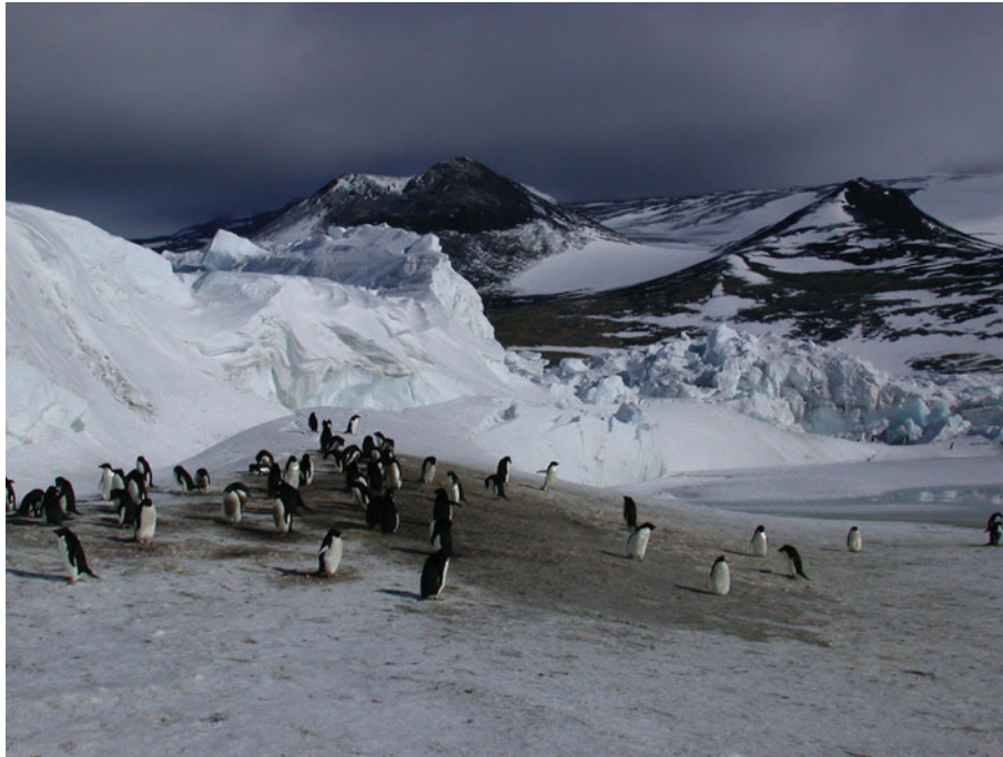
Fig. 4. Adélie penguins on the fast ice close to the Cape Crozier colony in spring 2002. Note the lack of evenly spaced nests and the high proportion of loafing penguins.

enigmatic atmospheric or climate changes, it is imperative that it is documented; broadly speaking, there is a need to identify which species will respond, adapt or display plastic behaviour and which species will fail with respect to our changing climate (Pettoelli 2012).