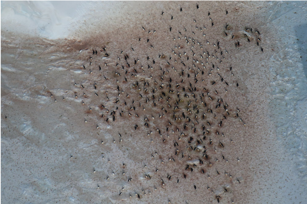
Fig. 2. Adélie penguins apparently 'nesting' on the fast ice off the coast of the Cape Crozier colony on 9 November 2018, the date of initial discovery.

recorded elsewhere in the Ross Sea (e.g. Cape Colbeck; LaRue et al. 2014a), a group of Adélie penguins were found. The birds were photographed using 400 mm telephoto lenses at this location on three occasions (9, 13 and 15 November 2018), as well as the surrounding landscape, and subsequently counted the number of individuals on the photographs from 9 November. We then reviewed VHR (via DigitalGlobe, Inc.) to determine whether the guano stain was detectable from the images and to verify the location and timing of arrival.