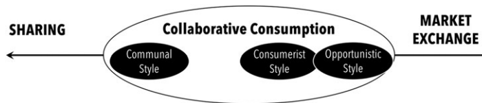
Figure 2. Positioning collaborative consumption styles (based on Guyader 2018).

who enact a communal style. A study by Klein et al (2022) showed that some people (“prosumers”) purposely acquire property (e.g. they buy a car); they use it but also capitalize on their ownership by providing others with access to that asset for a fee (e.g. they rent it out). These prosumers even choose which property to acquire, based not only on their own preferences but also on what their peers would like (e.g. particular car brands).