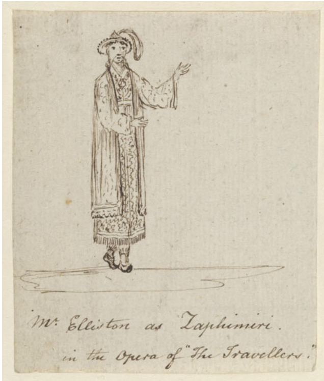
Figure 1. Sketch of Robert William Elliston (1774–1831) as Zaphimiri (c.1803–6, artist unknown).

(Naples in Act III and Caserta in Act IV), and finally end up in England in Act V. Along the way Zaphimiri gains a wealth of experiences but also gets in trouble – he is imprisoned for entering a harem in Turkey, then flees the country. The prince, as was common on the grand tour, has a tutor and others who accompany him. In fact, the voyage actually gains more significance for the prince’s entourage – his tutor Koyan, played in the original production by the great English tenor John Braham, is accompanied by a mother and a sister (Figure 2). 45 The subplot is as follows: upon arriving at their final destination in Portsmouth, the tutor, his mother and sister are reunited with their English husband/father, from whom they have been separated because he had returned to England even before the birth of the children. At the end of the opera, everyone stays in England – including the Chinese prince. In the final words of the prince, as he explains the reasons for his stay, we can glean a firm acknowledgement of the superior position of Britain: