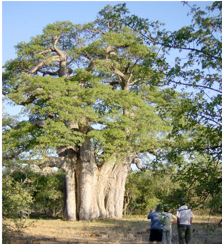
Figure 1 View from west of the Makulu Makete tree prior to its split

The Makulu Makete Wildlife Reserve, located in the northwestern part of Limpopo Province, South Africa, lies adjacent to the border with Botswana. It is the home of several large baobabs. The Makulu Makete tree, called “big tree” or “big baobab” by the owners, was the largest tree in the reserve. It had a height of 24 m, a circumference at breast height (cbh; 1.30 m above ground level) of 22.25 m and an estimated wood volume of \sim 180 \text{ m}^3 , see Figure 1. The GPS coordinates for the site are 22^\circ 34.584'S , 25^\circ 52.261'E , with an altitude of 719 m and mean annual rainfall of 388 mm.