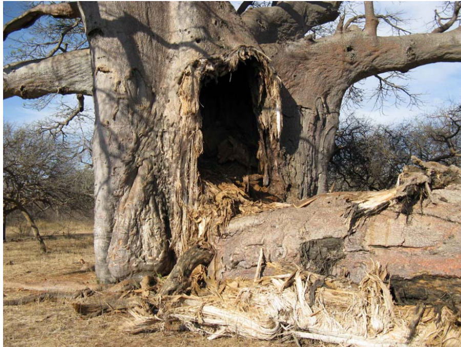
Figure 2 The northern section of the tree showing the cavity evinced after the southern section collapsed

depth of 2.20 m, and a maximum height of 2.70 m (see Figure 2). Investigation of the fallen southern section showed that approximately half of the cavity was located inside this part of the trunk. Eventually, the northern section also split into 2 parts and collapsed in November 2008. Today, the remains of the big baobab are lying on the ground in an advanced stage of decay.