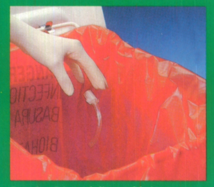
Step 2 — Discard disposable inner cannula in appropriate container.

So, take a big step in reducing the risk of contamination and infection—by throwing away the used disposable inner cannula. For more information, and for details on our informative video program about tracheostomy care, contact your Shiley Technical Representative at (800) 233-8969 or write to Shiley Incorporated, 17600 Gillette Avenue, Irvine, CA 92714-5751 U.S.A., Tel: (714) 250-