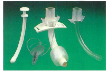
DIC is used with all Shiley disposable cannula tracheostomy tubes.

Since the DIC was first introduced, doctors, nurses and therapists have accepted it as a significant advance in reducing the risk of contamination and infection, as well as a time and cost saver.<sup>1</sup> Tracheostomy care procedures can be simplified and trach care kits can be eliminated.