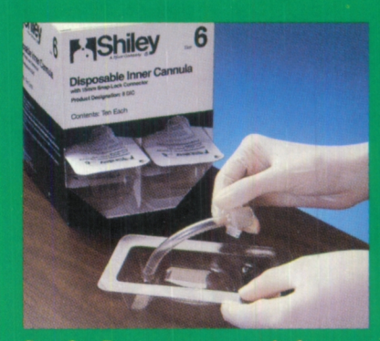
Step 3 — Remove new cannula from sterile container.

Step 3 —Remove the correct size DIC from its sterile container by the pinch clamps of the snap-lock connector using aseptic technique.