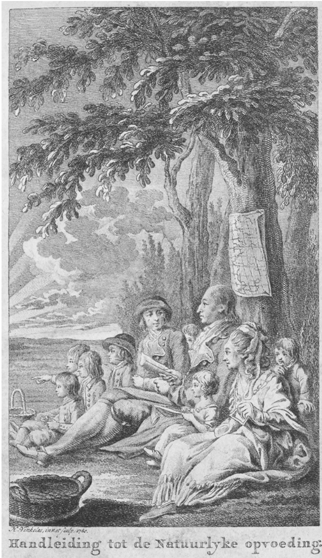
Figure 3. Campe, Handleiding tot de natuurlyke opvoeding of Robynson Crusoe , p. 11r

contains, depicts the readers' travel guides: the children (fig. 3). The reader catches them when they are listening to Robinson's story, told by father who holds the book in his hand. Children and adults are settled in the garden, since father prefers a direct – unmediated – observation of the natural world: "it would be a pity to see such a nice evening through glasses" (Campe 1780-1781, Introduction). 15 All protagonists line up and observe the natural environment right before them – one of the children even points its finger to highlight this collective observation process. The meaningful opening scene makes young readers aware of a radical merging of reading ("reading about"), observing ("seeing") and travelling within Campe's Robynson Crusoe , and thus presents reading as an unmediated practice of seeing places.