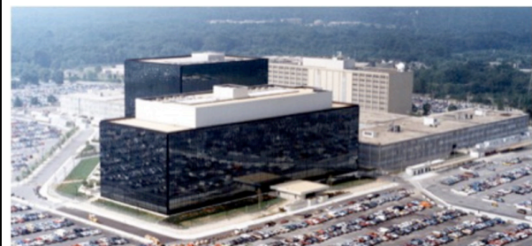
The National Security Agency, America’s largest intelligence agency, is also one of its least supervised.

Meanwhile there are no comparable moves towards curbing the NSA’s controversial data-mining of Americans, or the most illegal and counterproductive programs of all – the Special Forces killer squads and drone attacks, which in August 2012 killed a respected moderate Yemeni cleric, along with the al Qaeda representatives with whom he was negotiating. 40