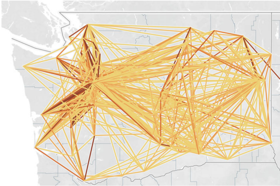
Figure 2. Heat map of originating and receiving hospital coordinations by WMCC.

critical care nurses to function in this role. These nurses are backed up by an on-call physician's medical direction.