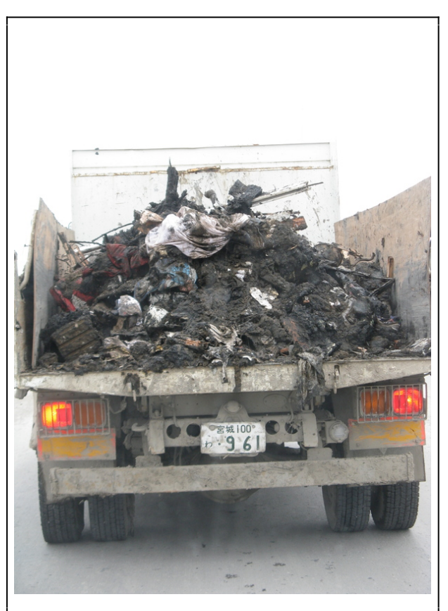
A truck hauls debris and sludge deposited by the tsunami to a temporary dump site. Because much of the sludge has already been moved from its original location, identifying that which came from potentiallycontaminated sites is a challenge.

For a city like Ishinomaki, where paper, fertilizer, feed, and chemical factories are located directly adjacent to the shore, near homes and schools, and over six million metric tons of debris washed up<sup>28</sup>, the giant wall of water destroyed conventional boundaries between "safe" and "hazardous." No one knows if oil and chemicals spilled in one place stayed put, washed out to sea, or ended up in another part of town.