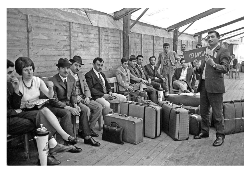
FIGURE I.4 Vacationing guest workers wait at the Düsseldorf airport for their flight back to Istanbul, 1970.

members to leave immediately. The result of this law, which critics in both countries decried as a blatant attempt to "kick out the Turks" and "violate their human rights," was one of the largest and fastest remigrations in modern European history. In 1984, within just ten months, 15 percent of the Turkish migrant population – 250,000 men, women, and children – packed their bags, crammed into cars and airplanes, and journeyed across Cold War Europe back to Turkey, with their residence permits stamped "invalid" at the border.