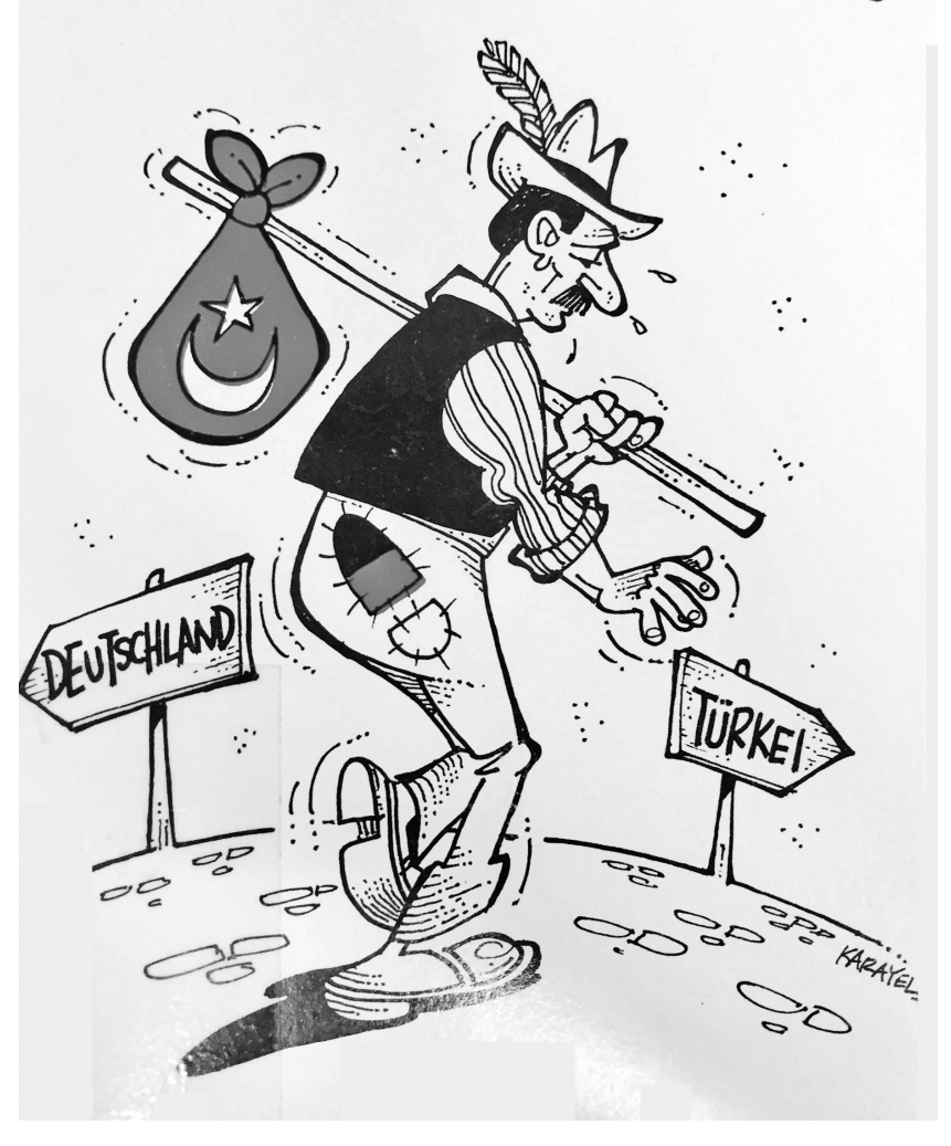
FIGURE I.2 Cartoon on the cover of the 1995 anthology Almanya'da Yabancı , Türkiye'de Almancı (Foreigner in Germany, Almancı in Turkey), illustrating the migrants' dual estrangement. Merhaba Yayınları, used with permission.