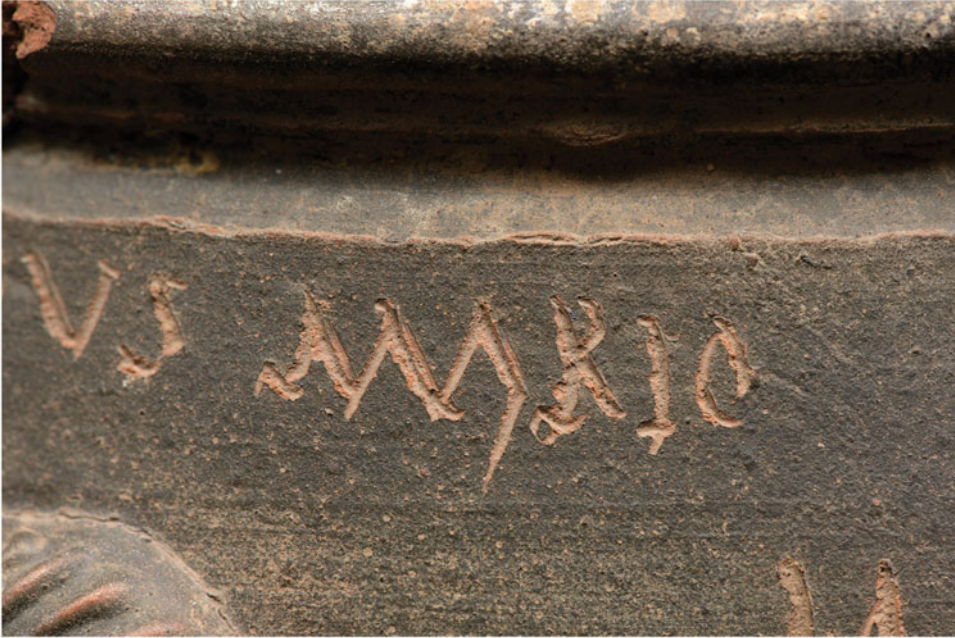
FIG. 5. The Colchester Vase inscription. Detail of the word MARIO.

Some letter forms, for example the S and L of legionis , indicate a wider affinity with Old Roman Cursive writing. 9