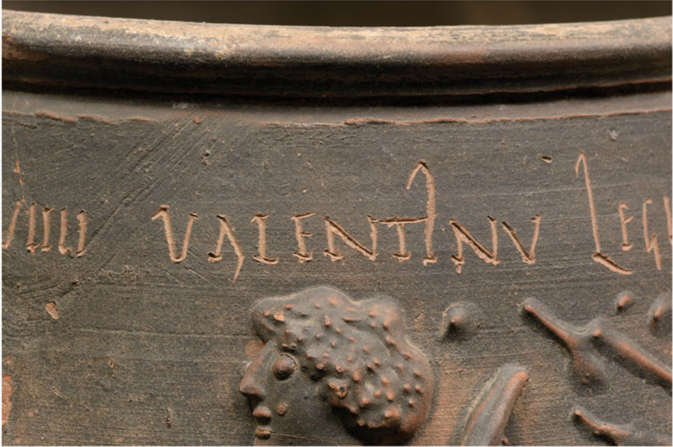
FIG. 3. The Colchester Vase inscription. Detail of the word VALENTINVS.