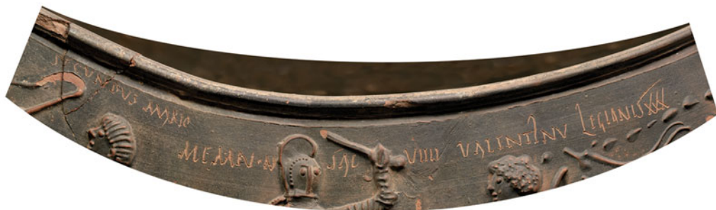
FIG. 2. The inscription below the rim of the Colchester Vase.

higher resolution images of the inscription, challenges current orthodoxy concerning the text's creation. The evidence of lettering is examined first before re-assessing the names of the performers and their associated attributes. 7