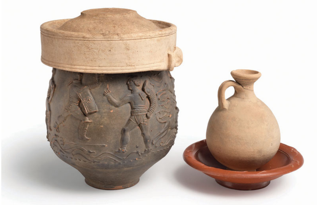
FIG. 1. The Colchester Vase burial group, including mortarium lid, dish and flagon, COLEM:PC.727–730.

affinities can be found in the companion paper. 4 Re-examination of the lettering, it will be argued, identifies the inscription as being cut before firing rather than afterwards, as current orthodoxy has it. Setting the inscription and images in the wider body of evidence for games enriches the insights which can be derived from the names and associated information into arena performers in the north-west provinces. Undertaken as part of Colchester Museums' Decoding the Dead project, osteological and strontium isotope analysis of the well-preserved cremated bones within the vessel enable them to be identified as the remains of a non-local male of 40+ years. Drawing on our study and its companion paper, the biography of the vessel and its implications for the understanding of the provision and celebration of gladiatorial games in Colchester are explored.