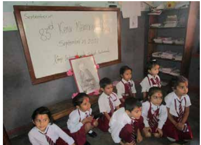
Image 9: Students of Kenji International School celebrating the anniversary of Miyazawa Kenji's birth