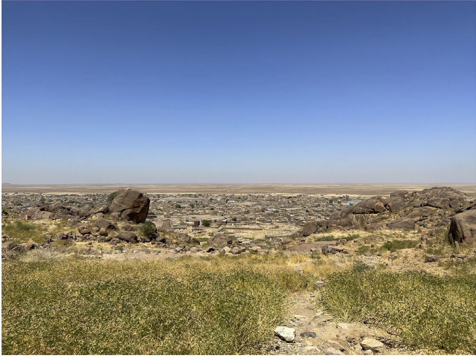
Figure 2. The village of Jebel Moya as seen from the top of the mountain.