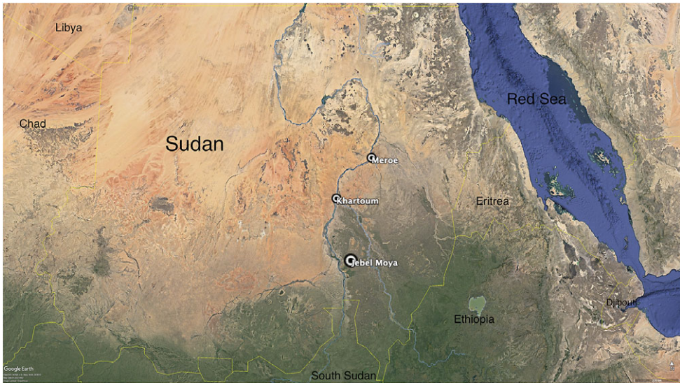
Figure 1. The location of Jebel Moya.

showed the world exactly what that means. Except that the world did not listen. Sure, there was press attention directed towards the 2019 coup, but the many stories and sacrifices of people on the streets barely made a splash in the Global North. 3 The world was warned many times. 4 But nobody listened.