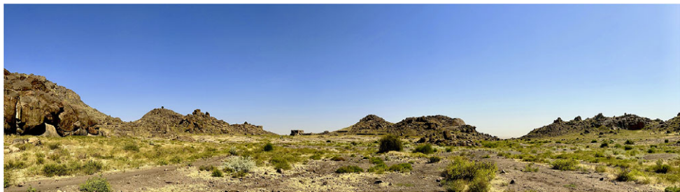
Figure 3. The archaeological site of Jebel Moya, right above the village.