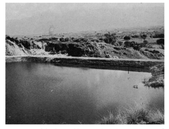
FIG. 2. One of the three Sukhomajri check-dams, showing in the background the green, cropped area below the dam.

provides the land, and they divide the crop equally with the larger farmer. Even the large landowners see that the coupon system is necessary to avoid the village tensions that would otherwise arise.