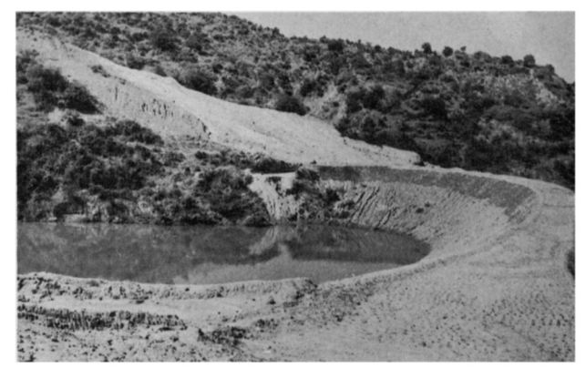
FIG. 3. Another Sukhomajri check-dam reservoir with, behind, a revegetated hill that at one time was practically barren.

Employment opportunities have increased. The villagers have adopted rope-making as a cottage industry, using hemp. Due to the construction of the reservoirs, the microclimate of the area has changed, such that nurseries have sprung up in the village. Plants of several types, ranging from ornamentals to those producing fruits and vegetables,