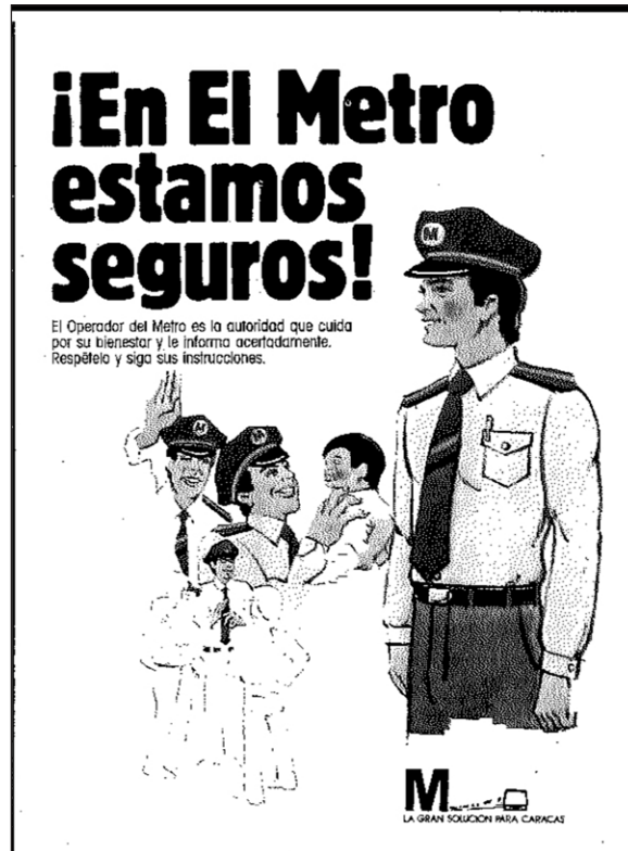
Figure 2: ¡En El Metro estamos seguros! El Operador del Metro es la autoridad que cuida por su bienestar y le informa acertadamente. Respételo y siga sus instrucciones. (We're safe on the Metro! The Metro's conductor is an authority that cares for your well-being and wisely guides you. Respect him, and follow his instructions). (Metro de Caracas, n.d.).