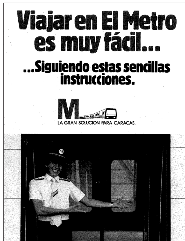
Figure 1: Viajar en El Metro es muy fácil ... siguiendo estas sencillas instrucciones. (It's very easy to travel on the Metro ... following these simple instructions). (Metro de Caracas n.d.).

In the two years immediately preceding its opening in 1983, a massive campaign—La Gran Solución para Caracas (The Grand Solution for Caracas; see Figures 1–3 )—sought to train residents for what planners