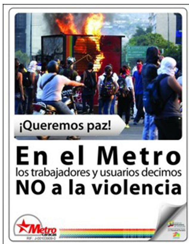
Figure 5: ¡Queremos paz! En el Metro los trabajadores y usuarios decimos NO a la violencia. (We want peace! Workers and riders of the metro say NO to violence). http://www.vtv.gob.ve/articulos/2014/04/02/actividades-culturales-y-entrega-de-volantes-trabajadores-metro-iniciaron-jornada-por-la-paz-4079.html .

siege mentality, a blocking off of a protected zone from a dangerous invasion or contagion. 8 The guarimbas extend a decades-long practice of erecting policed borders at the internal—racial and class—borders of the city. Protesters sought to destabilize the government, but in actions such as burning dark-skinned and red-shirted effigies at their barricades, they also betrayed a more crassly racist motivation to their desires to interrupt ongoing social reforms (Ciccariello-Maher 2007, 2014a, 2014b; Tinker Salas 2014).