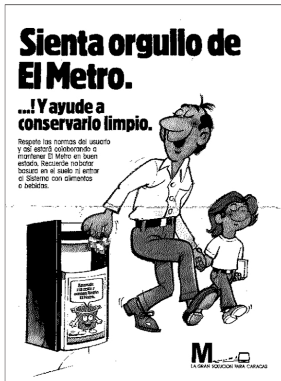
Figure 3: Sienta orgullo de El Metro ... ! Y ayude a conservarlo limpio: Respete las normas del usuario y así estará colaborando a mantener El Metro en buen estado. Recuerde no botar basura en el suelo ni entrar al Sistema con alimentos o bebidas. (Feel pride in the Metro ... ! And help keep it clean: by following the rules as a user you'll be contributing to the upkeep of the Metro. Remember not to throw garbage on the ground, or to enter the system with food or beverages). (Metro de Caracas n.d.).