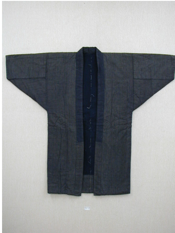
A men's hanten jacket, similar to the one in the text, Kitakyūshū Museum of Natural History and Human History

I learned that the old lady had been born in Meiji 32 (1899), in a small mountain village right around the border of Nagasaki and Saga Prefectures. There were about 30 families living there, all of them very poor. As villagers commonly did back then, they cultivated tiny pieces of land up in the hills, and to augment their livelihood, some would come down in summer to do odd jobs in town, or they would supplement their income in winter by making charcoal. Simply by being the first-born daughter, her fate had been sealed, since it fell to the first-born child to bear the brunt of the household duties. There was no questioning this, and one was not able to refuse. That was just the way things were up to the 1940s or so. Sisters and brothers followed in due course, but then, when she was 10, her mother died because she had gone back to work too soon