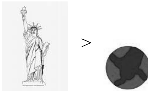
Figure 1. The Liberal world order.

(He begins drawing on the sandbox. Everyone pitches in. The final product looks like Figures 1 and 2. Everyone approves.)