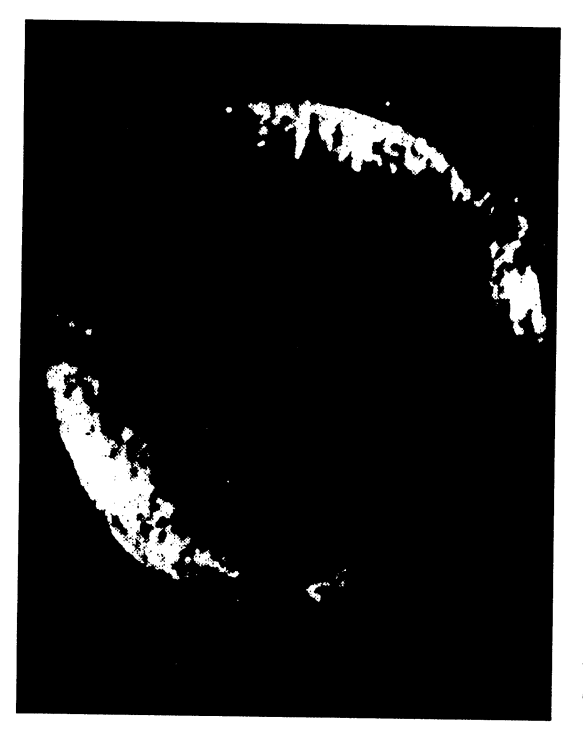
Fig. 2. Radio image of the remnant of SN1006. It appears as a ring, but in three-dimensional perspective it more nearly resembles a shell. This image, obtained through the courtesy of Professor Stephen P. Reynolds, was made with the Very Large Array of the National Radio Astronomy Observatory operated by Associated Universities, Inc., under cooperative agreement with the National Science Foundation. The three points of light are common background extragalactic radio sources (Reynolds and Gilmore 1986).

Its light illuminated the horizon and it twinkled a great deal. It was a little more than a quarter of the brightness of the Moon" (Murdin 1985: 15). The radio remnant of SN1006 is shown in Figure 2.