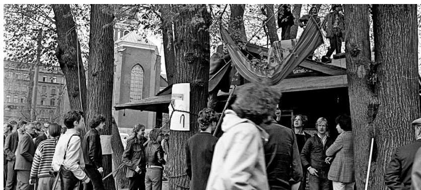
FIGURE 1.2 The “Elm Battle,” Stockholm 1971. Activists and engaged citizens opposed the planned destruction of elm trees that stood in the way of a new subway station in the heart of the capital.

Stockholm 1972 looks very different from the location of the Conference than it does outside Sweden. From a national perspective, many would consider the most significant site of environmental politics connected to early 1970s Stockholm to be a patch of thirteen Scots elm trees outside the Opera House in the public garden of Kungsträdgården. 25 After over a decade of sweeping redevelopment of central Stockholm, including the demolition of hundreds of centuries-old structures, plans to build a subway entrance where the trees stood sparked, in May 1971, a massive protest and clash with local authorities (Figure 1.2). “The Elm Conflict,” organized by an action group that would later become part of the local Stockholm chapter of Friends of the Earth, represented a turning point in modern Swedish politics, as it was framed as a matter of democracy