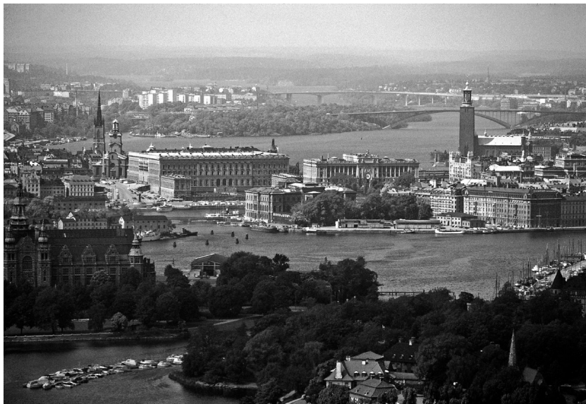
FIGURE 1.1 Stockholm during UNCHE in the early summer of 1972.

of change, we can identify new chronologies – indeed new “spaces of experience” and “horizons of expectation,” to use Reinhart Koselleck’s concepts. 13 Such fears and hopes of the Anthropocene are closely associated with features of the environment such as climate, biodiversity, the cryosphere, forests, and oceans.