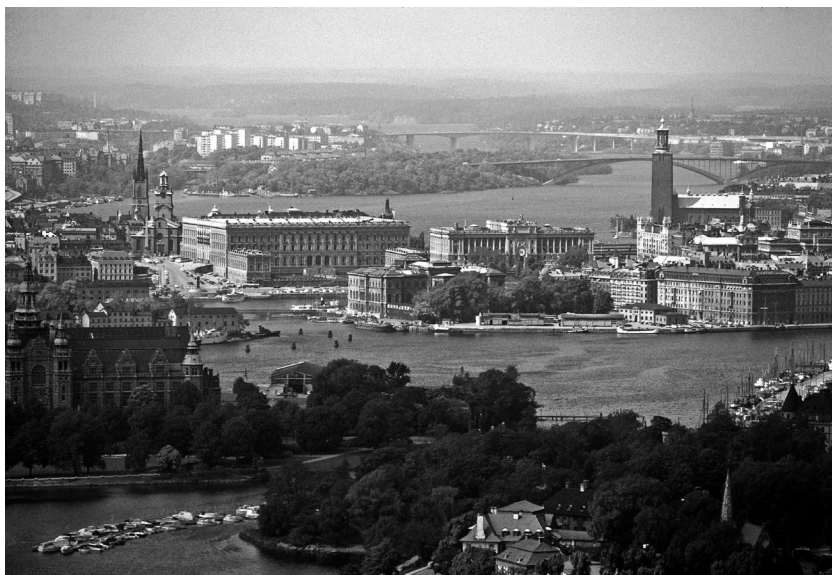
FIGURE 1.1 Stockholm during UNCHE in the early summer of 1972.

of change, we can identify new chronologies – indeed new “spaces of experience” and “horizons of expectation,” to use Reinhart Koselleck’s concepts. 13 Such fears and hopes of the Anthropocene are closely associated with features of the environment such as climate, biodiversity, the cryosphere, forests, and oceans.