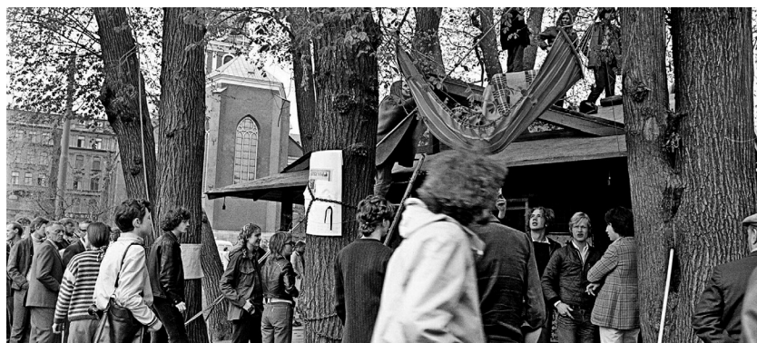
FIGURE 1.2 The “Elm Battle,” Stockholm 1971. Activists and engaged citizens opposed the planned destruction of elm trees that stood in the way of a new subway station in the heart of the capital.

Stockholm 1972 looks very different from the location of the Conference than it does outside Sweden. From a national perspective, many would consider the most significant site of environmental politics connected to early 1970s Stockholm to be a patch of thirteen Scots elm trees outside the Opera House in the public garden of Kungsträdgården. 25 After over a decade of sweeping redevelopment of central Stockholm, including the demolition of hundreds of centuries-old structures, plans to build a subway entrance where the trees stood sparked, in May 1971, a massive protest and clash with local authorities (Figure 1.2). “The Elm Conflict,” organized by an action group that would later become part of the local Stockholm chapter of Friends of the Earth, represented a turning point in modern Swedish politics, as it was framed as a matter of democracy