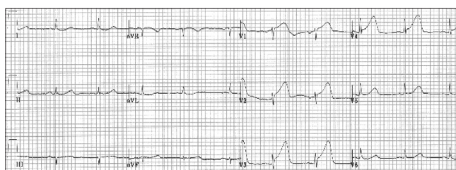
Fig. 2. Results of ECG of 59-year-old man with chest pain.