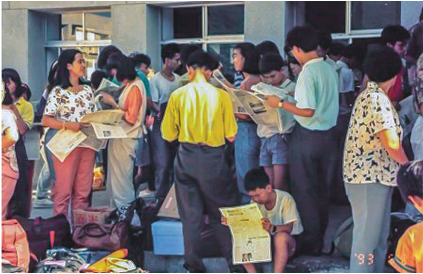
Fig. 5.1 A brand new issue of Matsu Report being distributed to passengers waiting at Fu'ao Wharf for a ship to Taiwan

its doors in 2006, Liu Jiaguo had already created the vibrant and lively forum of Matsu Online .