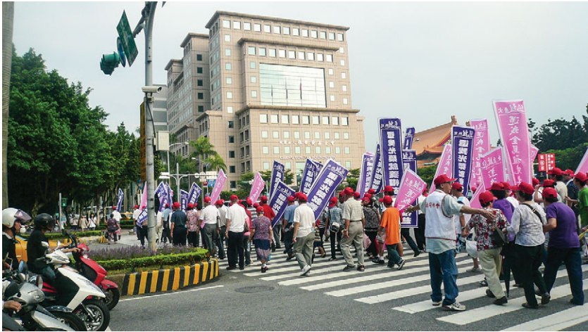
Fig. 5.6 Matsu people at the 823 March with the building of KMT Central Party Department in the background