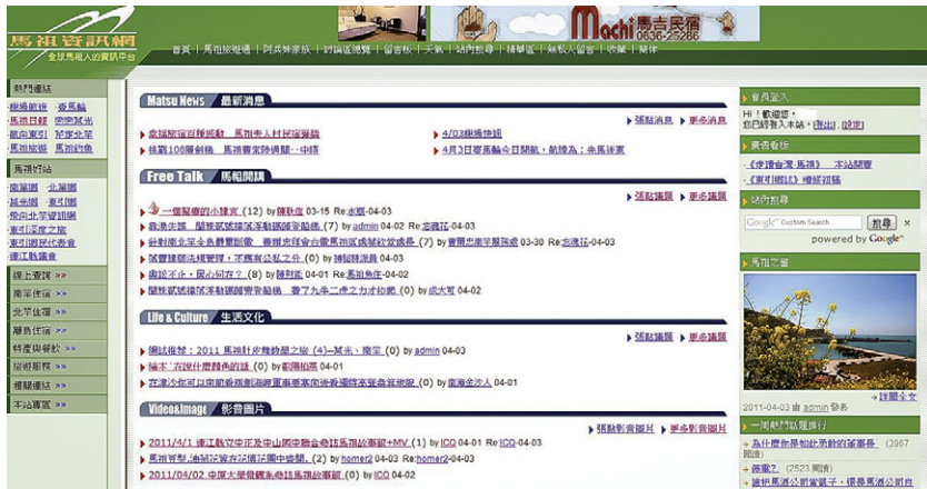
Fig. 5.2 The main page of Matsu Online

years, and it continues to change today. The interface and online content discussed here comes mainly from data collected over two years from November 2010 to October 2012, supplemented with my field research in the islands. This was also the period of peak usage for Matsu Online —with limited use of smartphone and application software (such as Facebook) in the islands at the time, the website’s significance was epochal. The structure of the site’s main page can be divided into the center, top, two sides, and four lower sections (Fig. 5.2). Each block has its own features and orientation to satisfy netizens’ demand for variety. Through close analysis, we can see how the people of Matsu also live together in an online community.