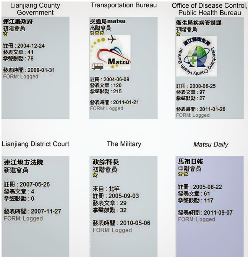
Fig. 5.3 All levels of government sections in Matsu have their own accounts on Matsu Online

fees to mail goods to Matsu, so Matsu Online offers a platform for shoppers to find one another in order to split the fees. If they buy in bulk, they may also receive discounts. Matsu Online has thereby become a helper for people living in Matsu.