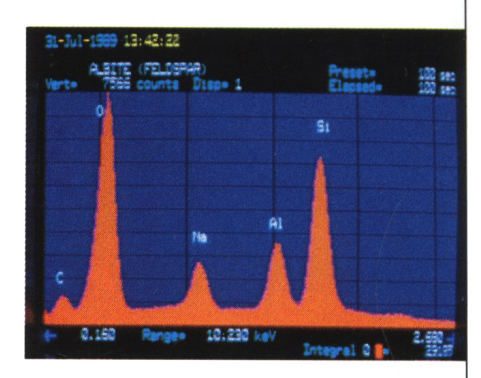
High sensitivity elemental analysis is possible with the addition of an EDS system.

Equipped with the interchangeable, high resolution pole piece, the JEM-2010 is also an ultra-high resolution microscope with 1.9Å resolution over 10° of tilt and an x-ray collection angle of 0.07 stearadians.