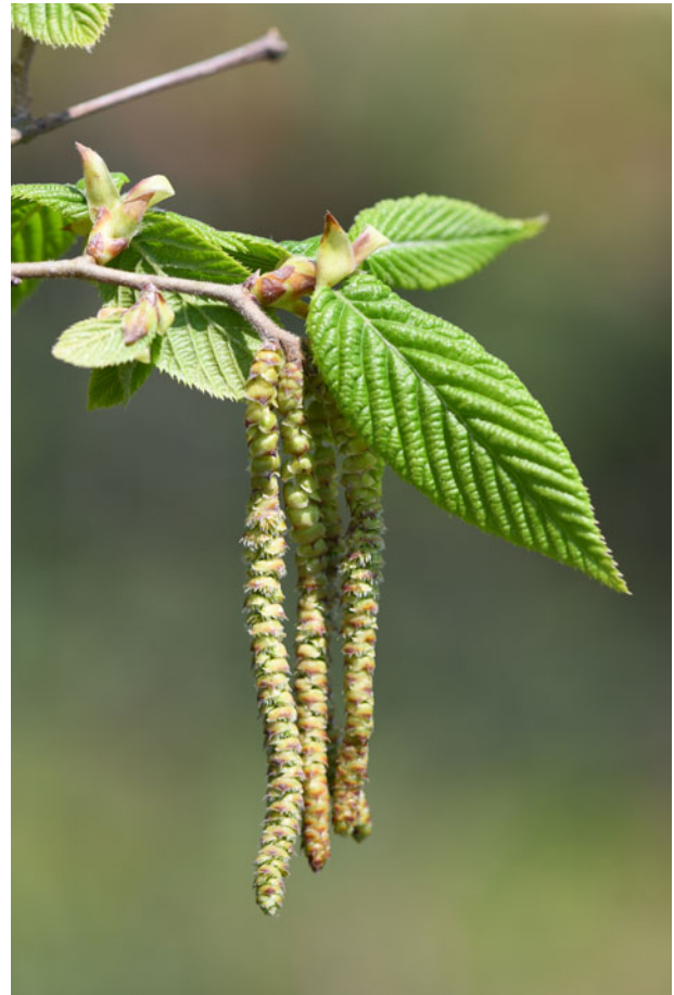
The Critically Endangered ironwood tree Ostrya rehderiana blossoming for the first time in Kunming Botanical Garden, China, in March 2024.

In Kunming Botanical Garden, O. rehderiana , influenced by Kunming's cold climate and high altitude, has a slow growth rate. The tree is 8.42 m tall and has a diameter at breast height of 9.8 cm. Its crown measures 7.5 × 4.8 m. Despite the tree taking approximately 30 years to bloom—a significantly delayed development—the event is unprecedented and is significant for botanical records.