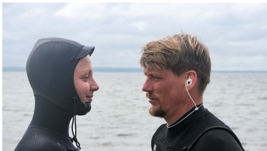
Figure 1. Photograph showing neoprene hood (left) and earplugs (right).

A positive attitude towards the use of earplugs was reported by 70 per cent 31 and 56 per cent 32 of surfers surveyed in the UK. According to Nakanishi et al. , 24 earplugs in surfing are used more often by professionals than by amateurs. In contrast, Simas et al. 18 confirmed the use of hearing protection equipment in 17 out of 93 (18 per cent) amateurs and only 1 out of 20 (5 per cent) professional surfers. 18 The reasons for using external auditory canal protection are usually associated with advanced external auditory exostosis severity and otological complaints. 15,21,26,27