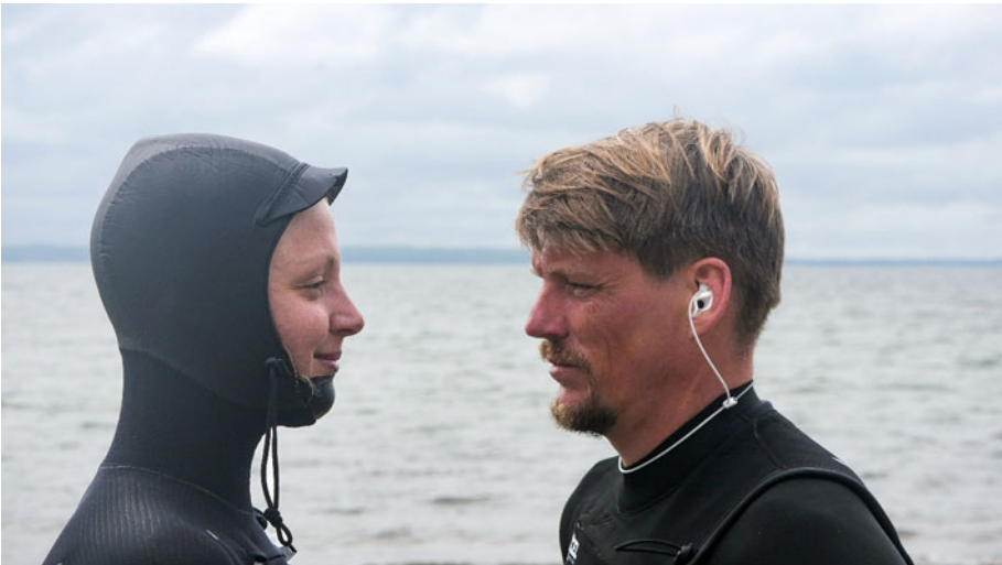
Figure 1. Photograph showing neoprene hood (left) and earplugs (right).

A positive attitude towards the use of earplugs was reported by 70 per cent 31 and 56 per cent 32 of surfers surveyed in the UK. According to Nakanishi et al. , 24 earplugs in surfing are used more often by professionals than by amateurs. In contrast, Simas et al. 18 confirmed the use of hearing protection equipment in 17 out of 93 (18 per cent) amateurs and only 1 out of 20 (5 per cent) professional surfers. 18 The reasons for using external auditory canal protection are usually associated with advanced external auditory exostosis severity and otological complaints. 15,21,26,27