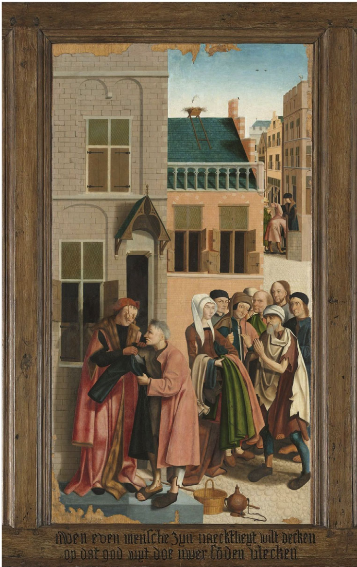
Figure 1. Master of Alkmaar, Polyptych with the Seven Works of Charity , 1504 (detail). Amsterdam, Rijksmuseum, SK-A-2815.

Spaces such as Nicolas Dupuis' workshop were open spaces which could potentially foster the transfer of religious knowledge, but can they truly be considered as public spaces? Jürgen Habermas' conceptualization of Öffentlichkeit typically links the idea of the 'public sphere' to the emergence of the capitalist and bourgeois society of the eighteenth and early nineteenth centuries. Over recent years, historians of the medieval and early modern periods have questioned Habermas' generalization of