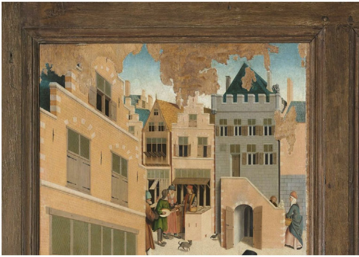
Figure 2. Master of Alkmaar, Polyptych with the Seven Works of Charity , 1504 (detail). Amsterdam, Rijksmuseum, SK-A-2815.

historical processes into a binary ‘before and after’, for example by pinpointing numerous ‘important continuities and overlaps’. 21 In a similar vein, Susanne Rau and Gerd Schwerdhoff have crafted a new definition of public spaces ( öffentliche Räume ) in the late medieval and early modern period: