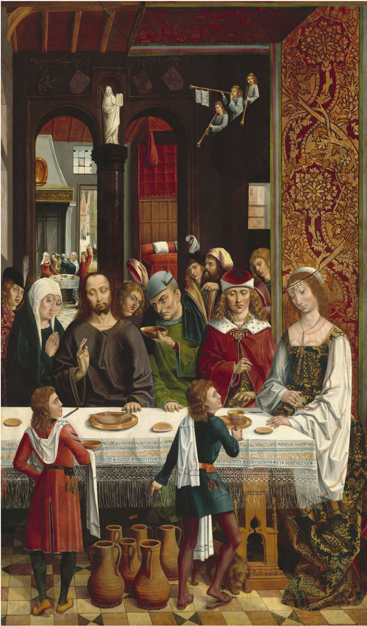
Figure 4. Master of the Catholic Kings (probably a Flemish master active in Spain), Marriage at Cana , 1495/97. Washington, National Gallery of Art, 1952.5.42. ( www.nga.gov/collection/art-object-page.41655.html ).

confraternity's rules are concise, they do nevertheless show that the organization was based on the Christian ideals of fraternity and charity as espoused by the Gospels: members promised each other assistance at markets in faraway places and in case of