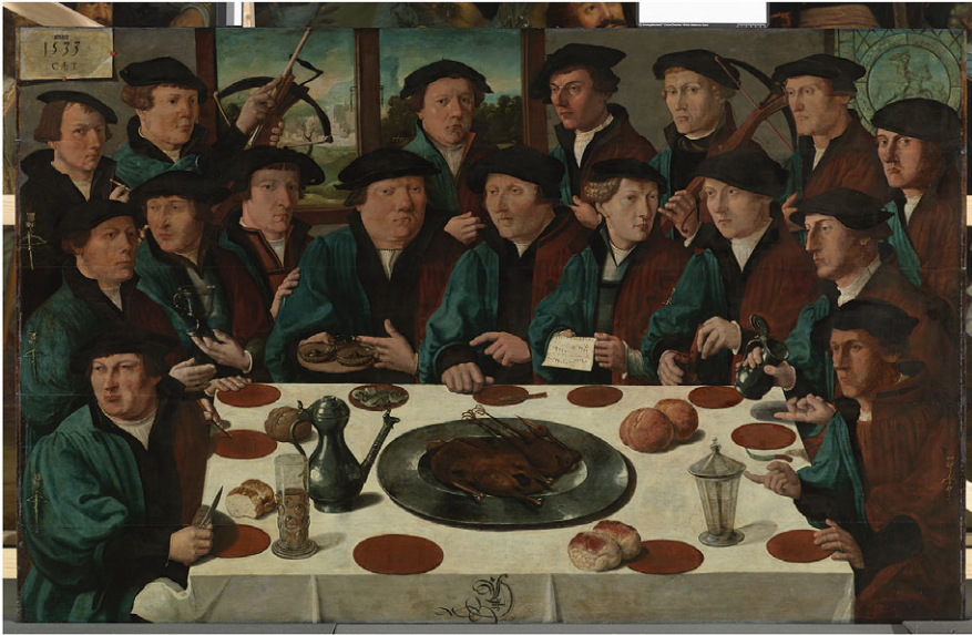
Figure 5. Cornelis Anthonisz, Banquet of the Crossbow Confraternity St Joris , in Amsterdam, 1533. Amsterdam, Amsterdams Historisch Museum, SA 7279. ( http://hdl.handle.net/11259/collection.38424 ). With two costly wine glasses for ceremonial drinking displayed on the table.

income loss. 52 New members (typically sons of sitting members, including illegitimate sons) were initiated at a collective drinking event of the brethren ( fratribus congregatis et eorum ghilde bibentibus ) that took place each year around the first day of February. 53 This would have taken place most plausibly at a public venue with sufficient seating space and serving wine, such as an inn or tavern. On these occasions, members would sit together rubbing shoulders, sharing wine and food. Given that the confraternity included clerics and lay people alike, it is likely that not only business information was exchanged, but also religious guidance was offered, and that the brethren also discussed religious topics.