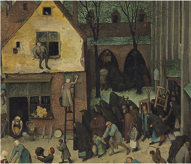
Figure 6. Pieter Bruegel the Elder, The Fight between Carnival and Lent (detail), 1559. Vienna, Kunsthistorisches Museum, Gemäldegalerie, 1016. ( www.khm.at/de/object/320722549d/).