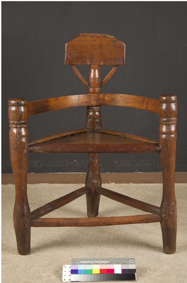
Figure 7. Small portable chair used for attending sermons ( driepootstael ), fifteenth century. Enschede, Rijksmuseum Twente, Inv. nr. 0259.

frequenting their convent, as well as the friars' request for a donation that would enable them to build a more spacious meeting hall that could accommodate the crowds that came to listen to their sermons and to perform devotional exercises. 74