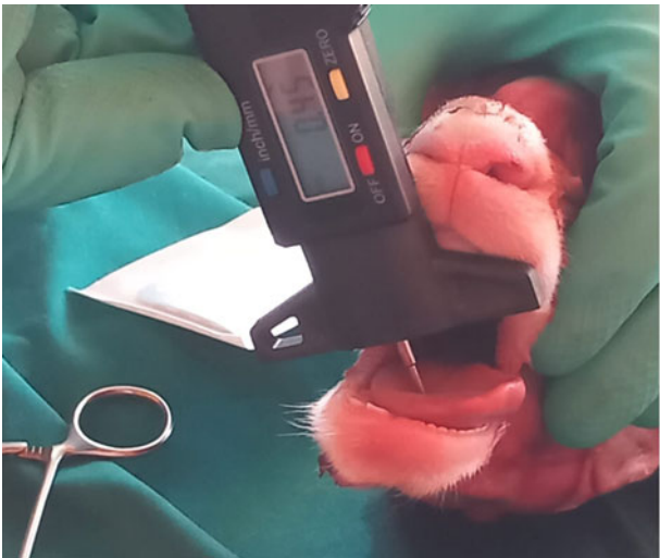
Figure 3. Depth measurement with a digital tyre gauge.

Quantitative variables were assessed by calculating the arithmetic mean and standard deviation values. Group differences were assessed using a two-sample paired t -test, or a Mann–Whitney U rank sum test if the variable was not