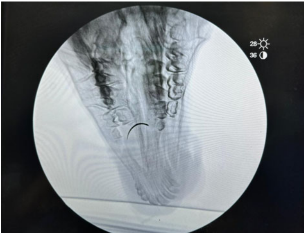
Figure 4. X-ray of a lamb's head with a surgical needle fragment in its tongue.