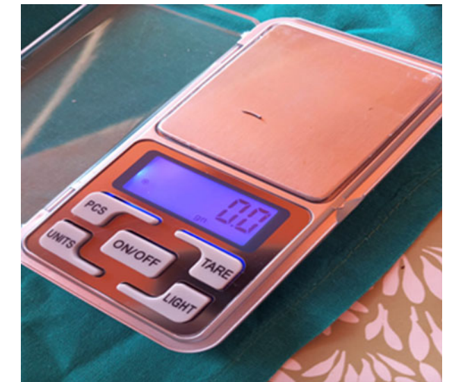
Figure 2. Different sizes of surgical needle fragments are weighed on a digital scale.

Quantitative variables were assessed by calculating the arithmetic mean and standard deviation values. Group differences were assessed using a two-sample paired t -test, or a Mann–Whitney U rank sum test if the variable was not