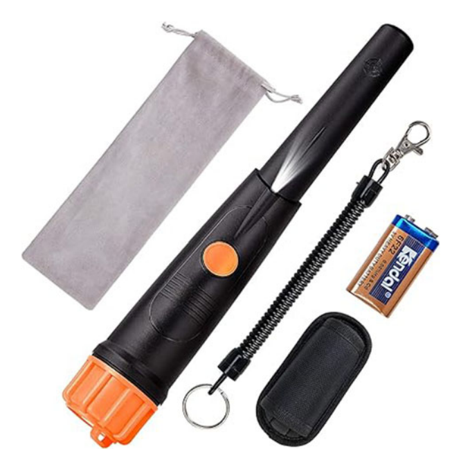
Figure 1. High-sensitivity metal detector (model IP-68; Inkbird Plus, Shenzhen, China).