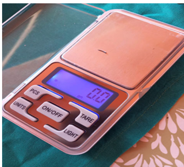
Figure 2. Different sizes of surgical needle fragments are weighed on a digital scale.

Quantitative variables were assessed by calculating the arithmetic mean and standard deviation values. Group differences were assessed using a two-sample paired t -test, or a Mann–Whitney U rank sum test if the variable was not