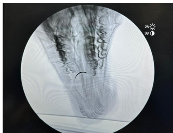
Figure 4. X-ray of a lamb's head with a surgical needle fragment in its tongue.