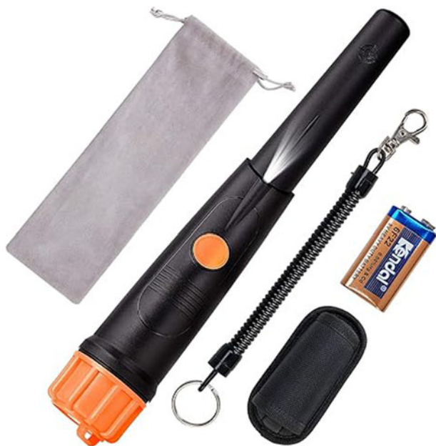
Figure 1. High-sensitivity metal detector (model IP-68; Inkbird Plus, Shenzhen, China).