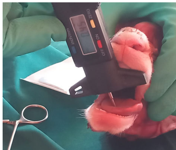
Figure 3. Depth measurement with a digital tyre gauge.

Quantitative variables were assessed by calculating the arithmetic mean and standard deviation values. Group differences were assessed using a two-sample paired t -test, or a Mann–Whitney U rank sum test if the variable was not