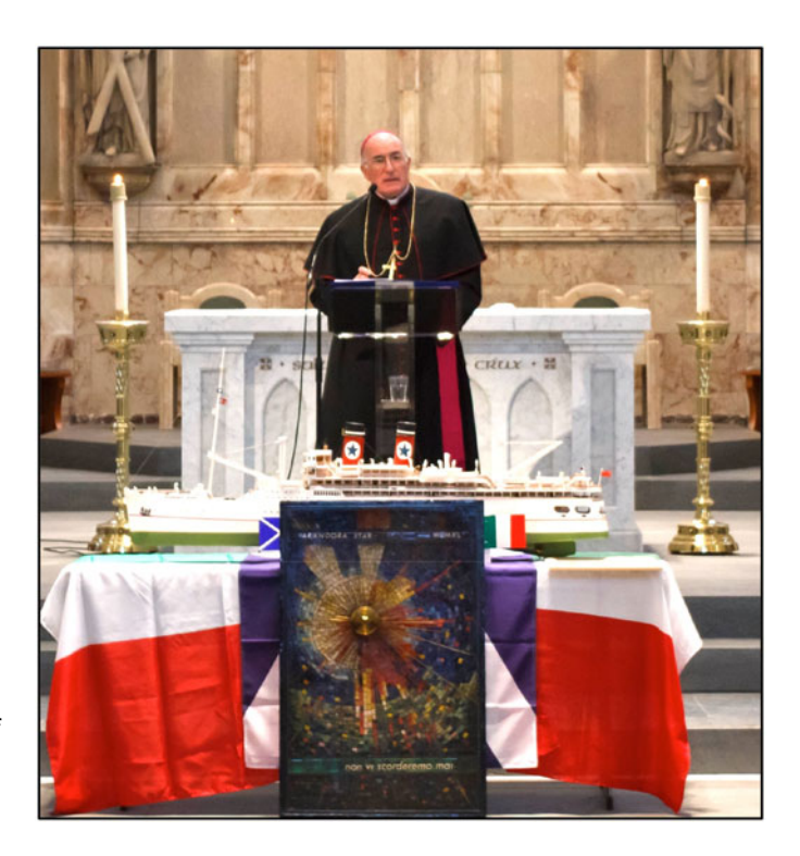
Figure 8. Archbishop Mario Conti, St Andrew's Cathedral, at the opening of the Italian Cloister Garden and Arandora Star Memorial, May 2011, with material objects — a model of the ship and 1975 commemorative mosaic

Another instance of IGIG's efforts is articulated through a commemorative mosaic, dating to 1975. Depicting the torpedo explosion, with the words 'non vi scorderemo mai' ('we