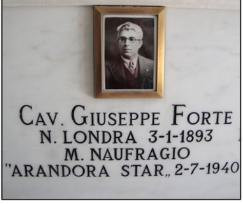
Figure 7. Documents in stone: Italy