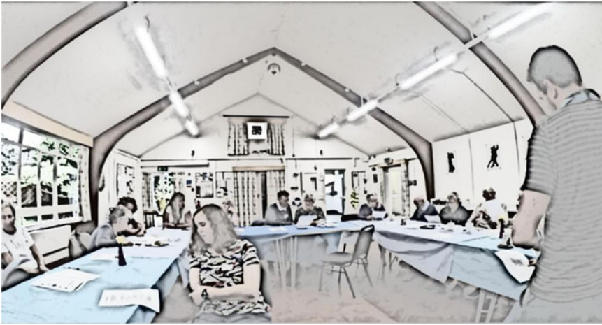
Figure 2. A village hall where a quiz is taking place.

of volunteers in places like memory cafes (Light and Delves, 2011). These large collective spaces and groups of people provide two key materials for a quiz to take place: a space large enough for a group and a number of potential players (Figure 2).