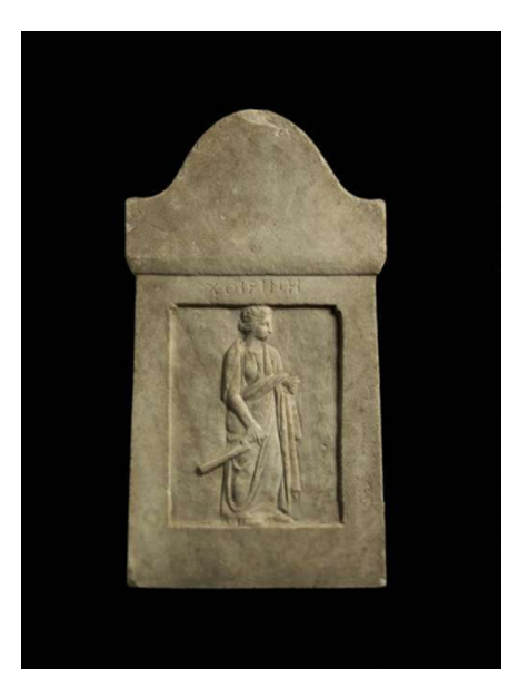
Figure 4. Grave marker of Choirine. From Athens, fourth century BC. She holds a key, indicating that she was a priestess. BM 2007,5001.1.

Ancient sources are central to the OCR Ancient History GCSE specification and especially the Depth Study, which is introduced with the statement that 'the focus will be on the critical use of ancient source material in investigating and assessing historical questions, problems and issues'. Inscriptions constitute ideal material for this endeavour and can be given to students in bite-sized portions. The AIE GCSE Ancient History notes and classroom slides focus upon a number of inscriptions which are relevant to the Depth Study on Athens in the Age of Pericles, 462–429 BC. They are central to the following topics: the workings of Athenian democracy, Pericles' foreign policy (including Delian League), cultural and religious life in the age of Pericles; women (questions of citizenship; role and position of women in daily life and marriage). Our material aims to address a wide range of aspects of the GCSE curriculum, covering culture, religion and military