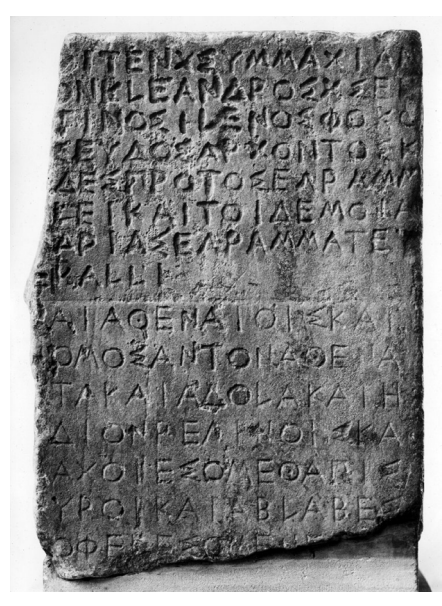
Figure 1. The Athenians' alliance with the people of Rhegion (south Italy), 433/2 BC. See AIUK 4.2 ( BM, Decrees of Council and Assembly ) no. 4.

launches take place periodically and are announced via social media. AIO hosts images of some inscriptions, and links to published versions of many more; it hosts also links to the Pleiades Project mapping website.