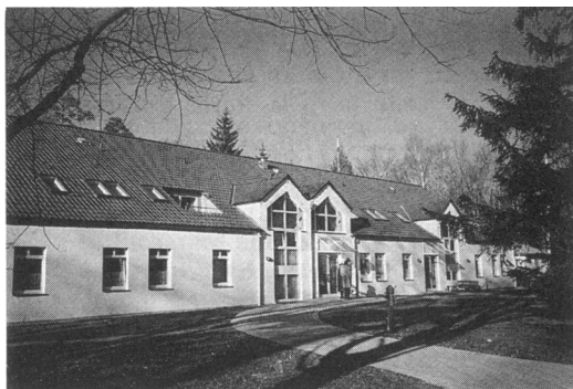
Rehabilitation unit: Der Ludwig Steil Hof, Espelkamp.

Areas of clinical concern in Germany differ from those preoccupying British psychiatrists. There is currently a review of the forensic psychiatry service following the recent attempted murder of two leading politicians and there is grave concern over an increasing alcohol problem among women. Benzodiazepine dependence, which has become such an issue for us working in the United Kingdom in the last ten years, is not seen as a problem in Germany. This may well be because of the lack of out-patient services and follow-up, and the psychological consequences of sexual abuse are not seen as a major problem by German psychiatrists, who view sexual abuse in terms of Freudian fantasy. Although AIDS is