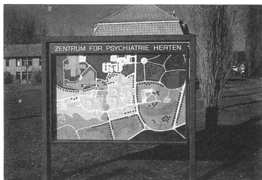
General hospital unit: Zentrum für Psychiatrie, Herten.