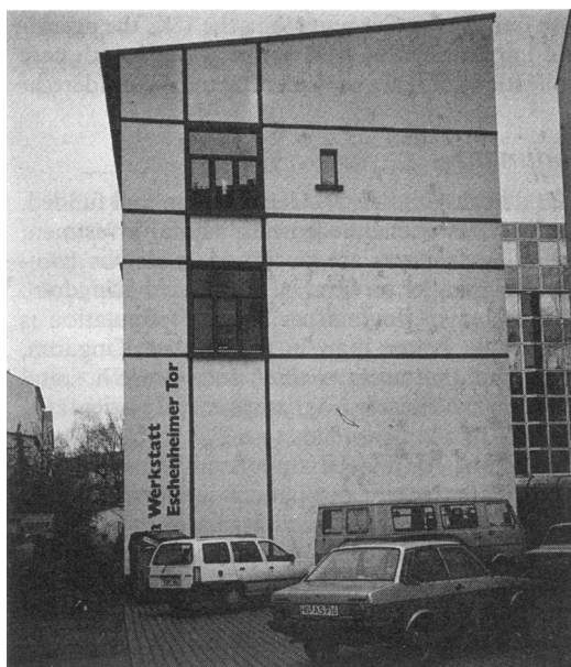
Workshop: Eschenheimer Tor, Frankfurt

Psychiatric illness in the community is seen as a social problem. Rehabilitation is through work, the German philosophy being that personal identity is achieved through work. Patients unable to return to full employment are offered places in sheltered work-