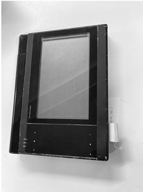
Figure 1.1 Active Book prototype, courtesy the Centre for Computing History (exhibit reference ID CH53902).

address (and resolve to their advantage) my student's question: whether an e-book counts . Drucker noted in 2003 how the most inflated millennium marketing claims promising 'the expanded book, the super-book, the hyper-book' deflated along with the companies that made them, fading from use as (sometimes visionary) devices and platforms failed to win audiences or deliver on their bold promises. 93 Realness is now more often framed in terms of equality with, not superiority to, print. E-reading device and e-book retailers are not only emphatic but also careful in their use of the word 'real' in marketing messages and product descriptions, deploying it strategically to describe discrete aspects of e-books as well as the books themselves. One example is how, when announcing the device launch of the second-generation Kindle, Amazon promoted its display technology as using 'real ink', but on an 'electronic paper display' that