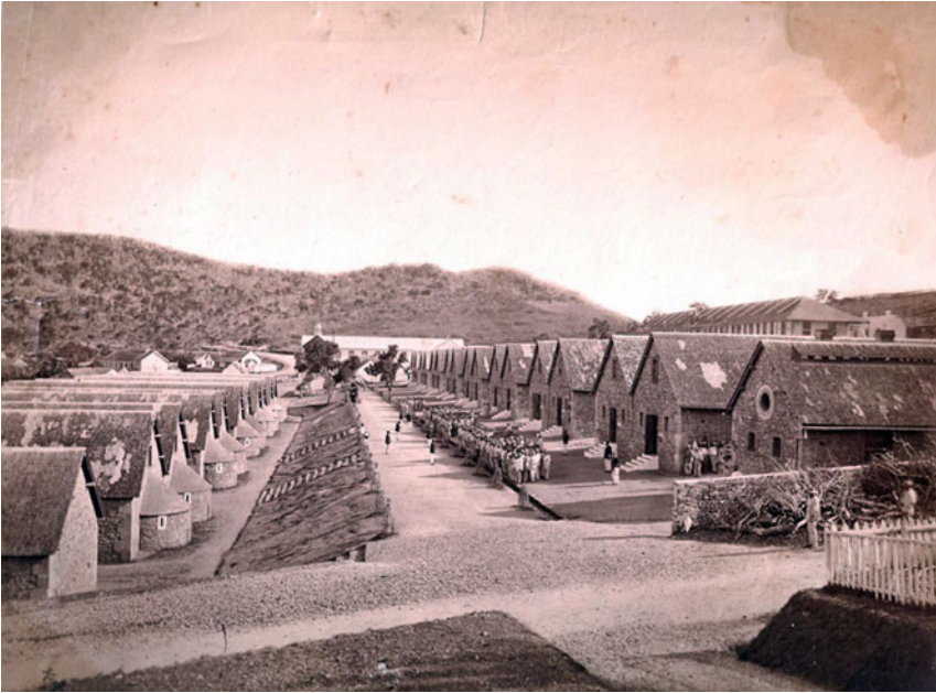
Figure 2. Allan Hughan, ‘Le boulevard du crime, 1877’. Bagne at Île Nou, New Caledonia. Musée Balaguier, La Seyne-sur-Mer, France.

(Figure 2). 17 For both European powers, convict transportation had a dual purpose – cleansing the metropole and expanding imperial holdings by putting convicts to work. This dual purpose, however, produced tensions at the system’s very heart: economic returns of coerced labour were undercut by the expenditure required to transport convicts to the antipodes. In duration and scale, the New Caledonian bagne was dwarfed by both Britain’s penal project in Australia and by France’s other overseas penal colony in French Guiana. 18 Contemporary observers and historians in their wake subjected French Guiana to greater scrutiny than the penal colony in the South Pacific. 19 Even when interest in New Caledonia was shown in the French metropole, it was overwhelmingly focused on Communards’ experiences.