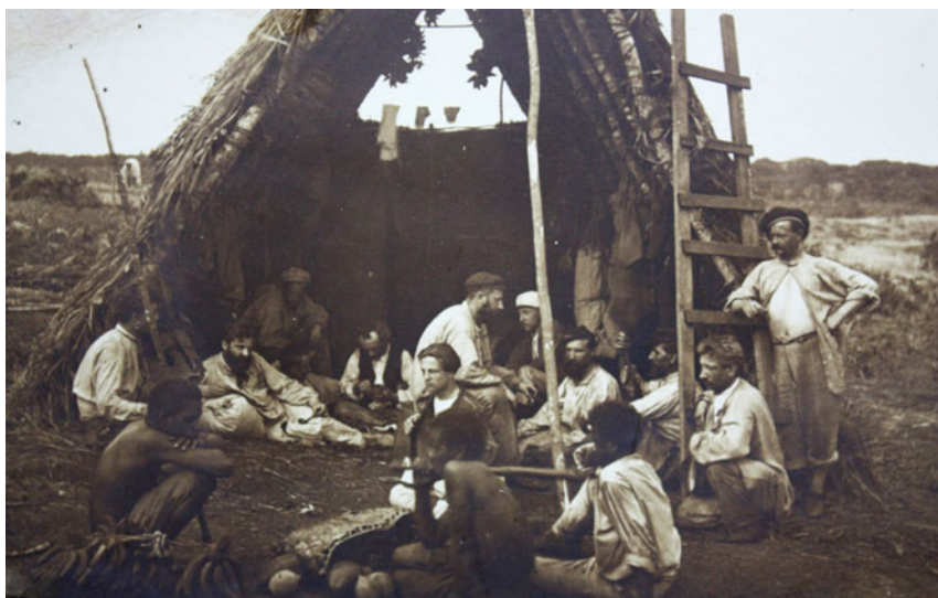
Figure 3. Allan Hughan, Encampment of Deported Communard Prisoners, Île des Pins, New Caledonia , private collection.

From 1872 until the amnesty in 1880, Communards were exiled to the Isle of Pines, an island southeast of the Grande Terre, while the political prisoners considered more dangerous (among them Henri de Rochefort and Louise Michel) were held on the Ducos Peninsula (Figure 3). 20 With only the rare exception (i.e. Michel, who, after being transferred from Ducos to the Isle of Pines, embraced Kanak culture), 21 the Communards portrayed their exile as utter desolation. 22 After the amnesty, some, among them the artist Lucien Henry, elected to settle in Australia. 23 The overwhelming majority, however, returned to France.