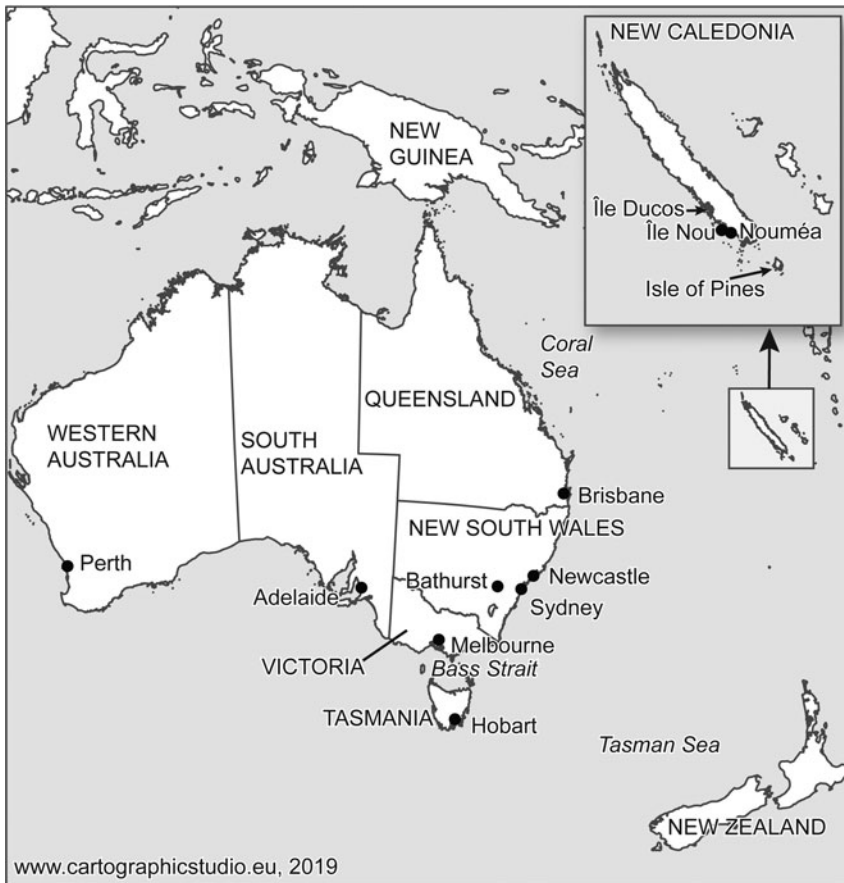
Figure 1. Map of Australia and New Caledonia.

colonialism omits its relationship to Australia. 2 Historians have explored France's early fascination with Britain's Australian experiment, 3 but little attempt has been made to study the strange synchronicity of France's incorporating convict transportation into its penal-colonial repertoire at the very moment that Britain, under the force of resistance by settlers in Australia