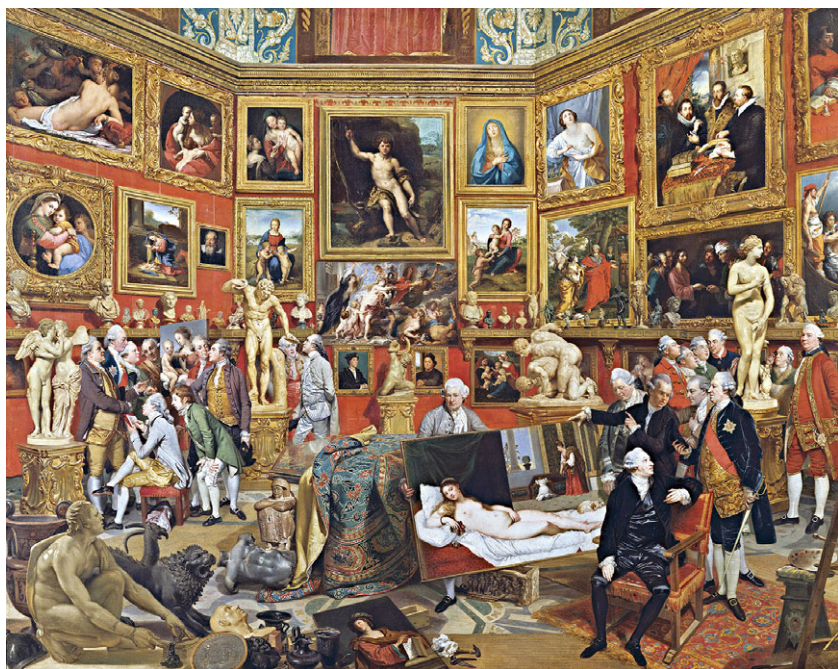
Figure 1.3 Johann Zoffany, The Tribuna of the Uffizi (1780).

composition that recreates some tourists' sense of being overwhelmed by the "folds within folds" as artistic styles and genres become close neighbors, and visiting connoisseurs crowd tightly in this aesthetic cul-de-sac . Millar interprets the painting as "a mixture of indefatigable industry, cupidity, self-seeking and imagination." 33 Rather than a literal depiction, Zoffany's Tribuna was, in Wolfgang Ernst's words, "a marvelous misreflection." 34 And yet The Morning Chronicle wrote in 1780 that "this