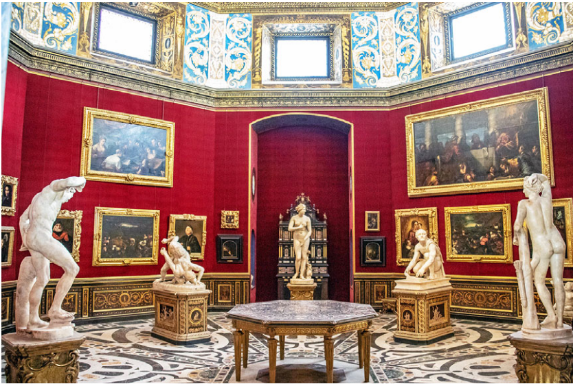
Figure 1.2 Bernardo Buontalenti, The Tribuna (1581–1583). The Wrestlers (deep left); Venus de' Medici (center); The Listening Slave (deep right). The Uffizi Gallery, Florence, Italy.

example of proportion, taken on tours in travel guides as a standard of excellence, and insistently included in novels and poems. 16