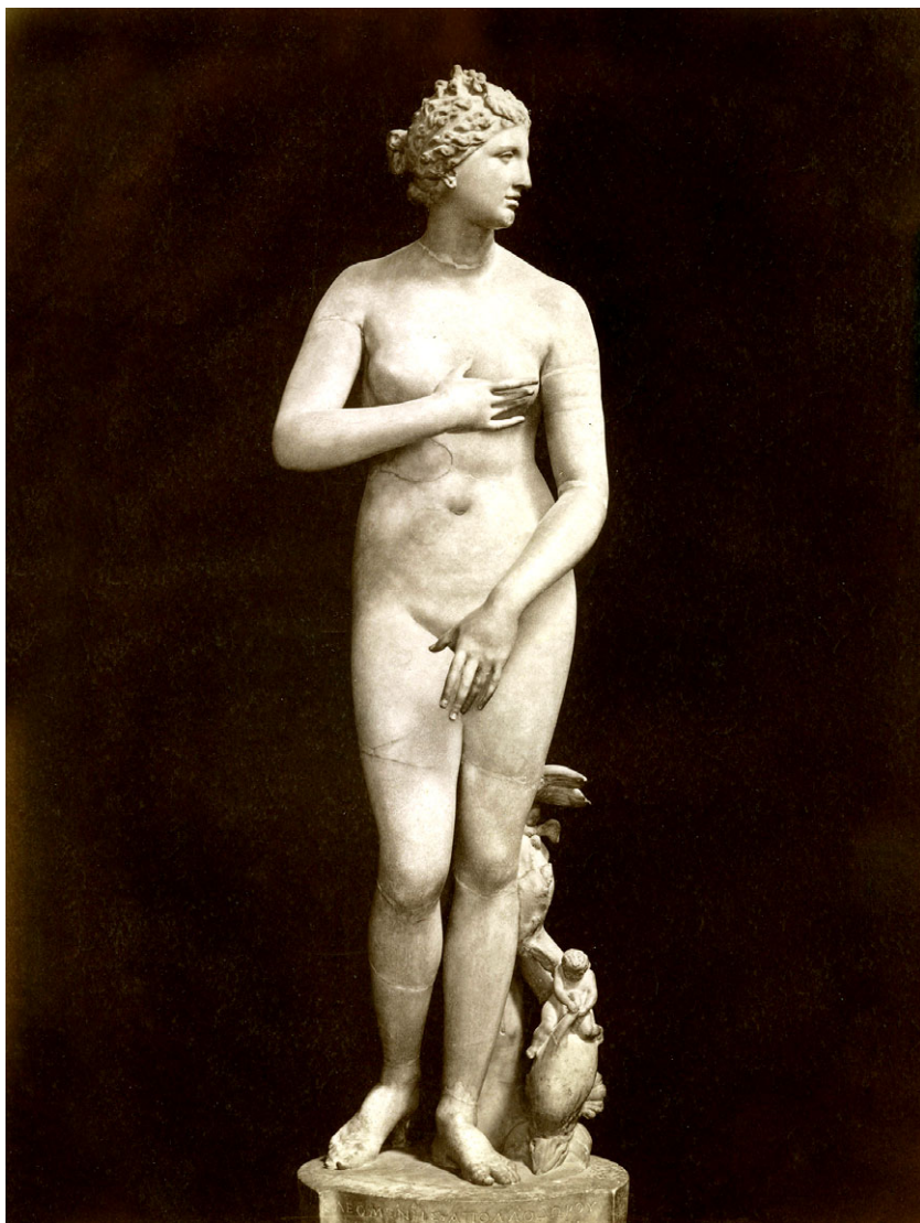
Figure 1.1 Venus de' Medici . First-century BCE copy of a fourth-century BCE statue. Uffizi Gallery, Florence, Italy.