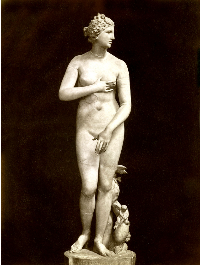
Figure 1.1 Venus de' Medici . First-century BCE copy of a fourth-century BCE statue. Uffizi Gallery, Florence, Italy.