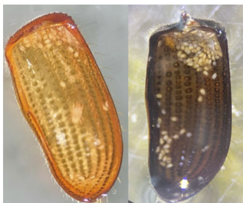
Figure 1. Mites belonging to operational taxonomic unit (OTU) B 1 , clustered at the top of both images, at the anterior end of the elytra, and a single representative of OTU A, seen in the middle of the elytron in the left image, found on the subelytral surface from two representative Douglas-fir beetles collected in the present study.

morphologically identified by H.C.P. as Winterschmidtidae: Parawinterschmidtia furnissi (Woodring) (Browning et al. 2024). It is possible that the beetles hosted deutonymphs of both mite families and, by chance, only the hemisarcoptids were sent for barcoding and only the winterschmidtids were sent to H.C.P. for slide-mounting. A photo of an extracted specimen of OTU B 1 at BOLD (specimen UNBC1-35-04 in DS-DFBMITES) is morphologically consistent with P. furnissi ; however, deutonymphal winterschmidtids and hemisarcoptids are morphologically quite similar, so without slide-mounted BOLD-extracted specimens, we cannot confirm the photo is of P. furnissi .