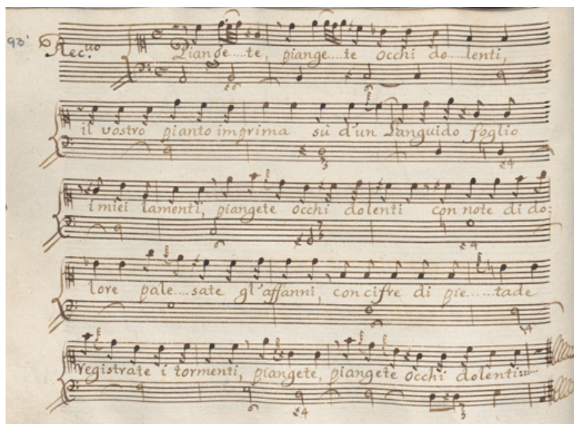
Figure 9 Domenico Scarlatti, ‘Piangete, occhi dolenti’ (after 1730), Österreichische Nationalbibliothek, Mus. Hs. 17664, f. 93 v

succession by the same singer. It would be logical to have one singer representing each of the characters in cantatas, but the texts themselves ventriloquize the voices of the other enough that such strict dramatic delivery or demarcation is not necessary in this context. In contrast to earlier lettere amoro se, the clear stylistic alternation between recitatives and arias naturally creates a kind of exchange that in a way functions in the place of actual letters that the singers may be ‘writing’. The lettera amoro sa is, as we have seen, an opportunity to perform multiple perspectives at once and to transform, as the inky tears of the opening passage of ‘Piangete, occhi dolenti’ do, the unseen physical tokens of grief into the legible symbols for an absent lover. As in all lettere amoro se, the music strives to overcome both time and space: the absent becomes present, voices are commingled, and the past is manipulated in the present.