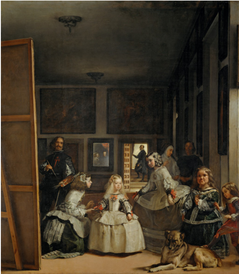
Figure 2 Diego Velázquez, 'Las Meninas' (1656), Museo del Prado

The early history of musical letters is extensive and spans several centuries and genres. 27 Nearly all the musical scholarship on the topic of the lettera amorosa has been centred on or oriented towards the love letters of Claudio Monteverdi. But the lettere amoroze of the seventeenth century were neither the beginning nor the end of this rich tradition of singing letters. The provocative