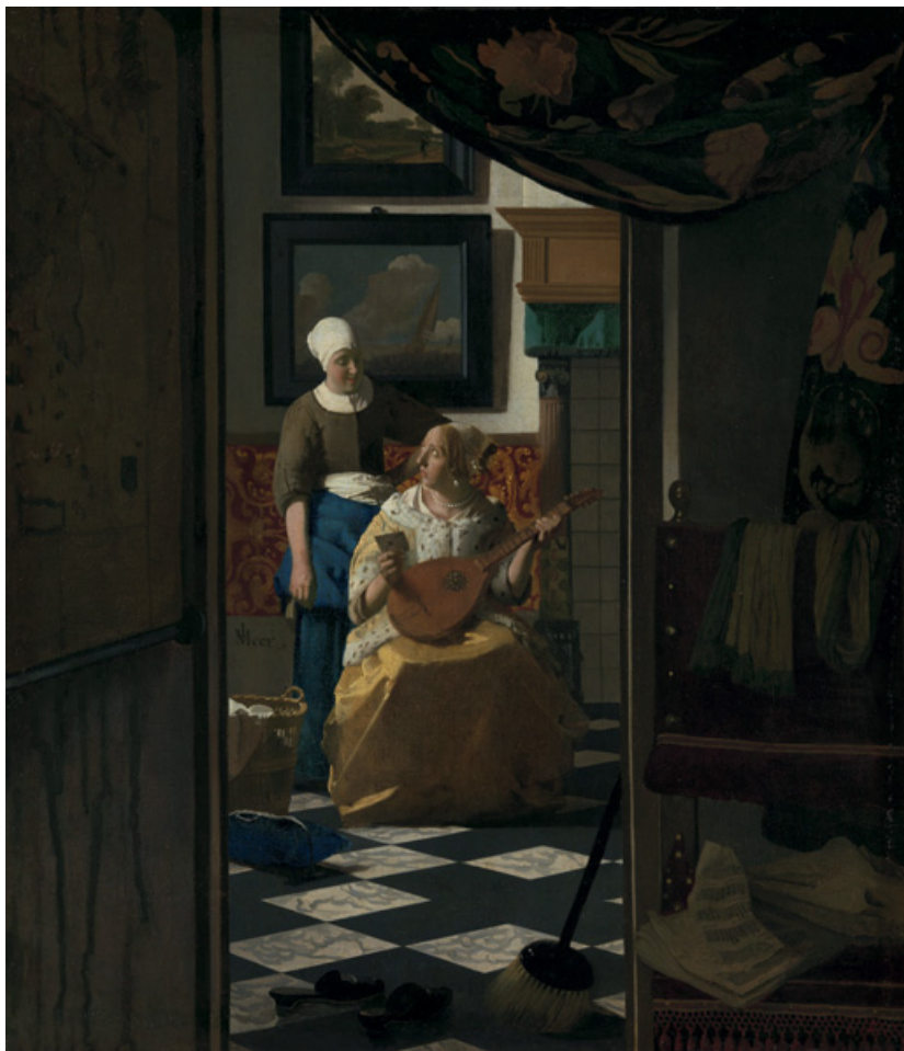
Figure 1 Johannes Vermeer, ‘The Love Letter’ (c.1669–70), Rijksmuseum

here, but the curiousness of the image does not settle onto one interpretation alone. 2