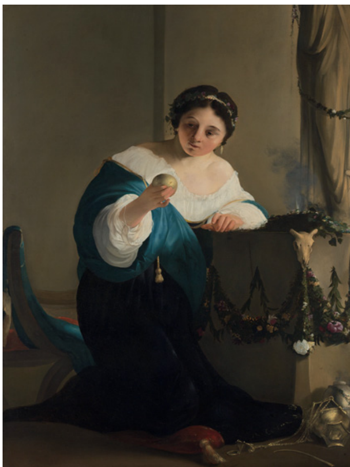
Figure 4 Paulus Bor, ‘Cydippe with the Apple of Acontius’ (c.1645–55), Rijksmuseum

The mythological story of Cydippe and Acontius is a paradigmatic tale for the use of letters to exercise power over the voice of another (see Figure 4). The story survives in three primary sources, as discussed in detail by Patricia