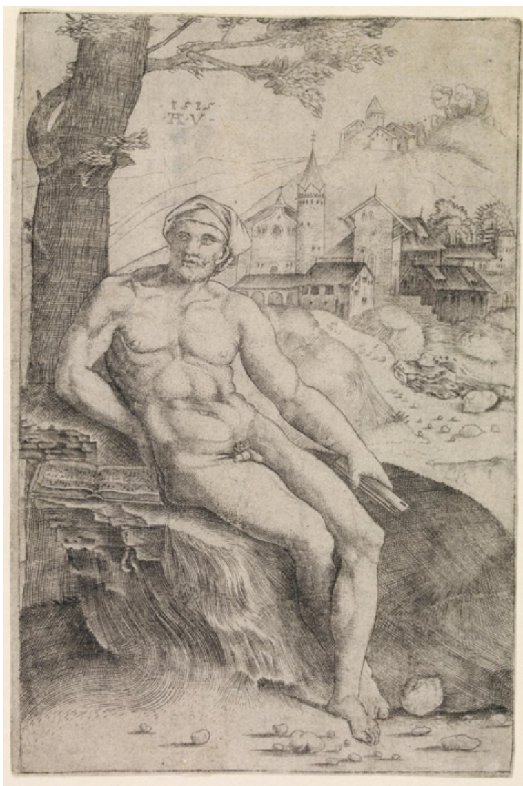
Figure 6 Agostino Veneziano (after Baccio Bandinelli), ‘Male Nude with Music Book’ (1515), The British Museum

Her quotation of his untruthful and misleading words would be a kind of retaliation in performance, as his receiving voice is the one forced to utter them.