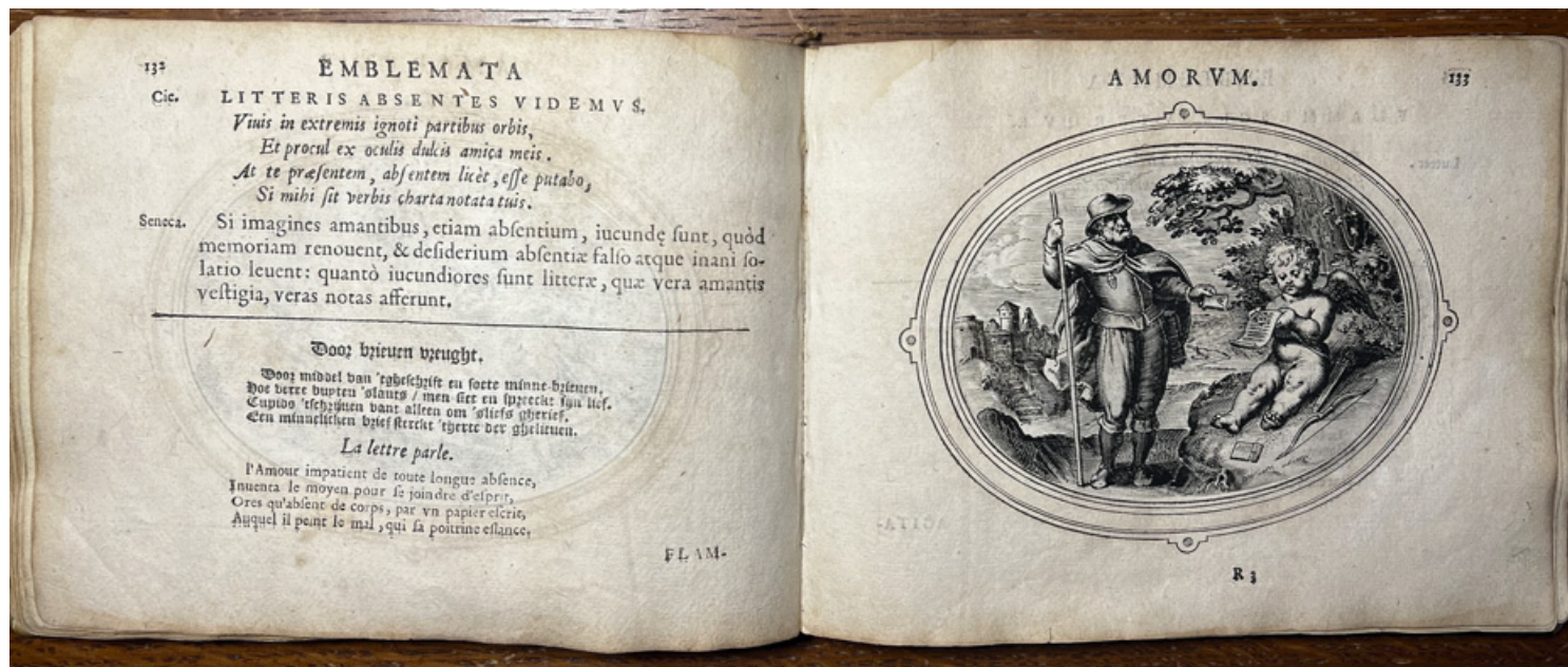
Figure 3 Otto van Veen, Amorum emblemata (Antwerp, 1608), pp. 132–33, David M. Rubenstein Rare Book and Manuscript Library, Duke University.