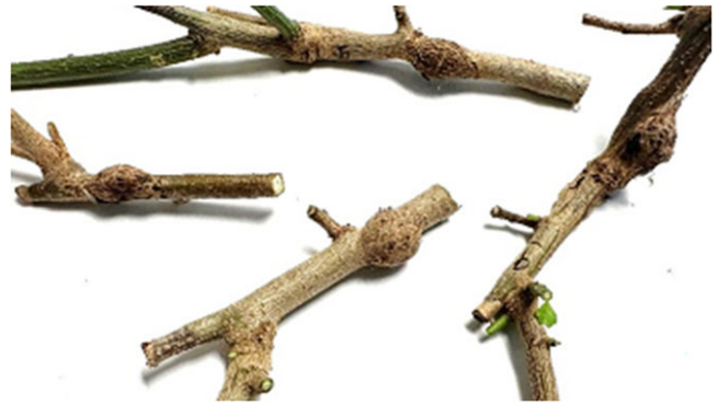
Figure 3. Galls on Schinus terebinthifolia stems 6 mo after inoculation from cultured mycelial mats placed onto stem abrasions.

Small galls (~5 mm) first became apparent on roughly 20% of plants 2 mo after plants received the purified hyphal inoculum. By