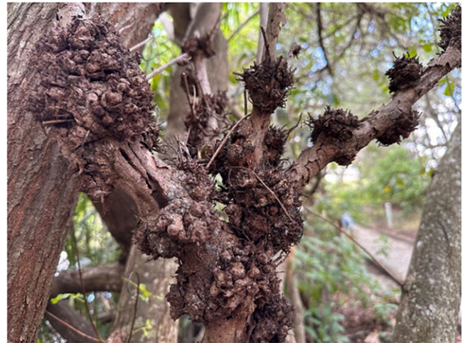
Figure 1. Large 10-cm-diameter galls and witch's broom-like growth on a dead branch from a mature Schinus terebinthifolia in the field.

Live branches with galls were collected from mature S. terebinthifolia plants at a field site in Broward County, FL, USA (25.95725°N, 80.40788°W). Galls on these mature trees were up to 10 cm in diameter (Figure 1). We sampled branches roughly 3 cm in diameter, transported them to the laboratory, and harvested 1- to 3-cm-diameter galls that were still covered with green bark. Gall tissues inside green bark were still live and were composed of hypertrophied sapwood.